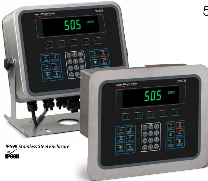
IP69K Stainless Steel Enclosure IP69K