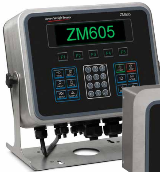
IP69K Stainless Steel Enclosure Graphic Display IP69K