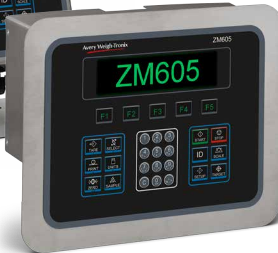
IP66 Stainless Steel Panel Mount Enclosure Graphic Display