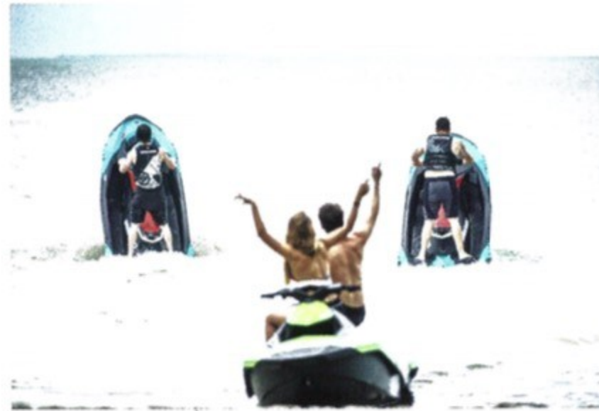
JPI Mercury Marine MercuryMarine.com

The Spark Trixx offers a whole new, much easier way for the entire family to play on the water. Based on the popular Spark, the Trixx offers greater leverage via an adjustable riser and handlebars as well as foot wedges for sure footing during dramatic vertical tricks. It also features an extended-range variable trim system for increased upward and downward thrust.