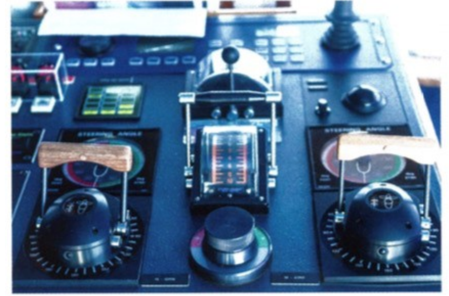
VIRB Ultra 30 Garmin Garmin.com

Whether in the dark of night or midday light, the Ocean Scout TK Handheld Thermal Night Vision Scope helps boaters see hazards, obstacles, aids-to-navigation, and people in the water over 100 yards away. It's easy to use straight out of the box, offers several video color palettes for enhanced viewing and features still imaging and video recording.