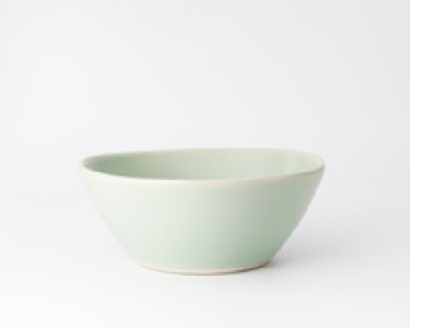
35 oz. Bowl 8" diameter x 3.5" height Item no. 02-03-40 / SDB-L-40 oz. Pictured in Celadon