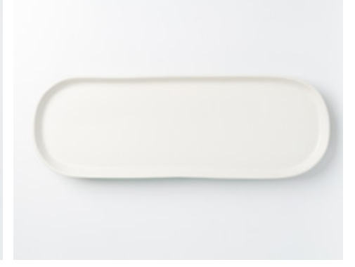
16.5" Platter 16.5" wide x 5.5" long, .75" lip Item no. 03-07-16 / PL-Oyster-16.5" Pictured in White