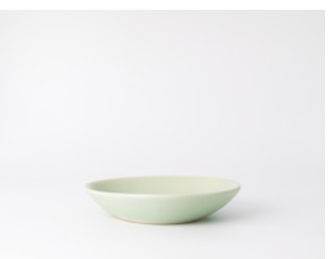
9 oz. Soup Plate

13.5" wide x 10.5" long, 2" lip ltem no. 03-03-13 / Civet Pictured in Black