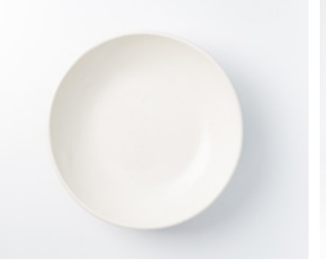
65 oz. Serving Bowl 11.5" diameter x 2" height Item no. 03-03-11 / SB-S Pictured in White