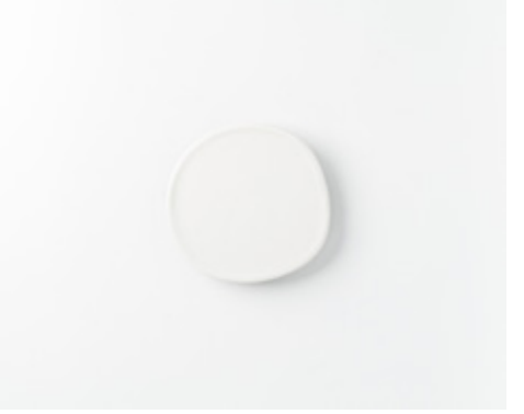
6.5" Flat Plate

8.5" diameter, .5" lip Item no. 01-01-08 / Rip-Salad-8.5" Pictured in Grey