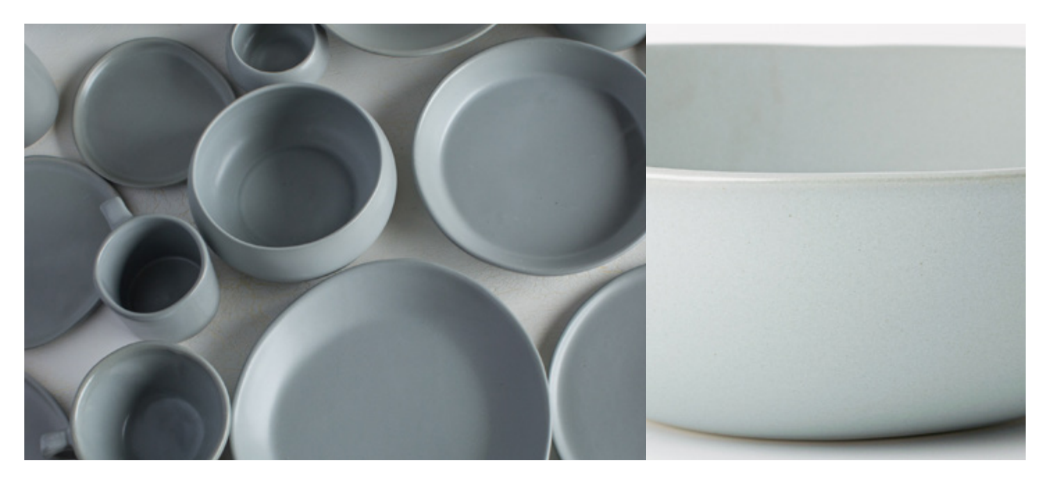
Grey Modern, minimal, elegant

Soft cool green, based on historic Korean Goryeo period glazes from the 12th century. The satin surface and subtle application variations make this quiet glaze come alive.