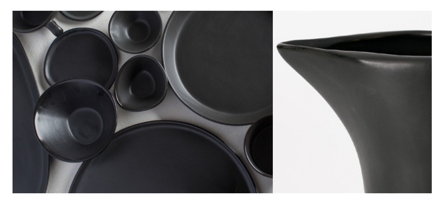
Black Sophisticated, luxe, warm

Our satin white is simple at first glance, but looking deeper reveals hidden depths and variation, like a beautiful fragment of Greek marble or a sheet of handmade paper intended for a 19th century manuscript.