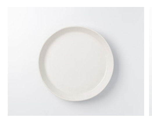
10.5" Coupe Plate 10.5" diameter, 1" lip Item no. 02-02-10 / Skali-Coupe-L-10.5" Pictured in White