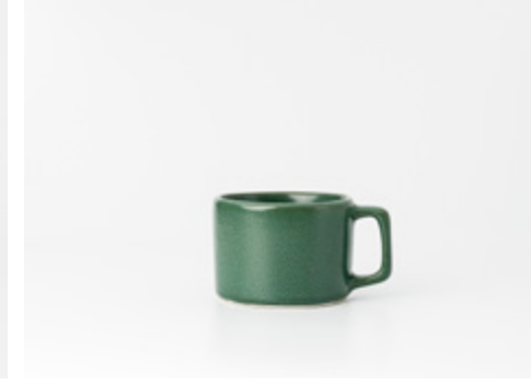
10 oz. Coffee Mug 4" diameter x 3" height Item no. 02-06-12 / M-Short-L-10 oz. Pictured in Fern