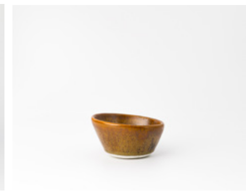
6 oz. Bowl 4.25" diameter x 3" height Item no. 02-03-06 / SDB-S-6 oz. Pictured in Burl