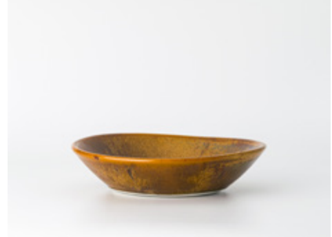
20 oz. Soup Plate

6.5" diameter x 1.75" height Item no. 01-04-09 / Rip-Soup-S-9 oz. Pictured in Celadon