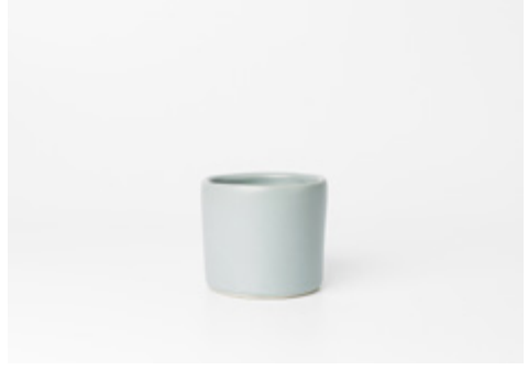
9 oz. Handless Cup 3.5" diameter x 3" height Item no. 02-06-11 / CC-Short Pictured in Grey