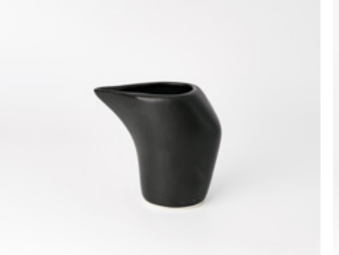
20 oz Pitcher 3.5" wide x 5.5" height Item no. 03-09-20 / Pitcher-20oz. Pictured in Black Also available in 10 oz.