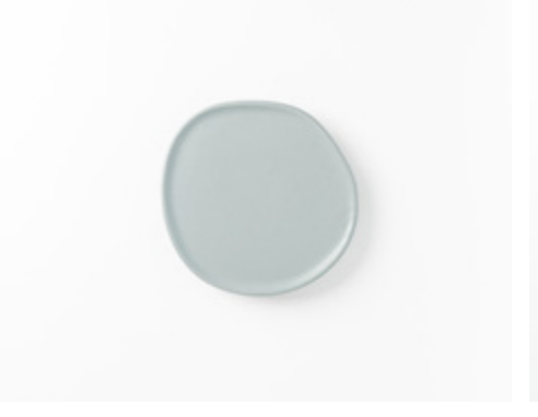
8.5" Flat Plate

11" diameter, .5" lip Item no. 01-01-11 / Rip-Dinner - 11" Pictured in White