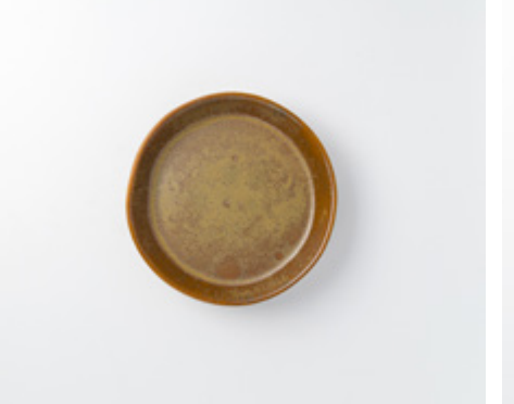
8" Coupe Plate 8" diameter, 1" lip Item no. 02-02-08 / Skali-Coupe-M-8" Pictured in Burl