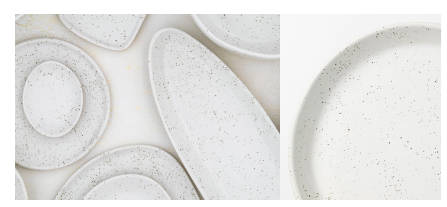
Birch Natural, organic, relaxed