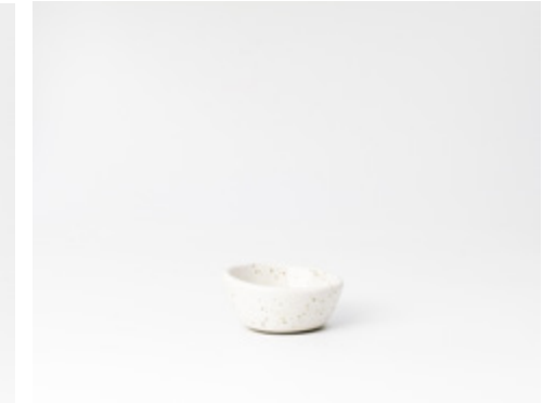
2.5 oz. Bowl 3.5" diameter x 1.5" height Item no. 02-03-03 / SDB-XS-2.5 oz. Pictured in Birch