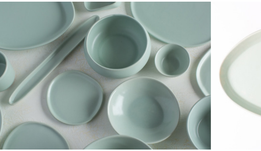
Celadon Cool, fresh, verdant

Our bestselling core colors were selected because they fit our shapes perfectly and are at home in any operation.