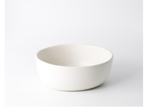
48 oz. Bowl

8" diameter x 2" height Item no. 01-04-20 / Rip-Soup-L-20 oz. Pictured in Burl