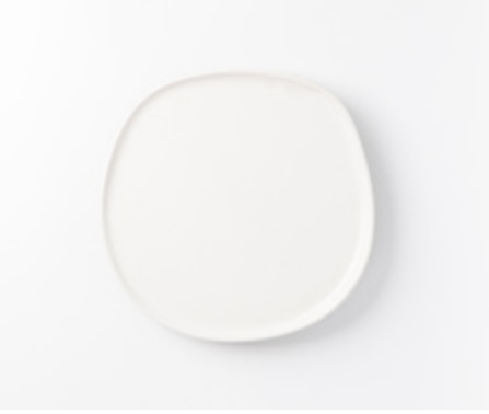
11" Flat Plate

11" diameter, .5" lip Item no. 01-01-11 / Rip-Dinner - 11" Pictured in White