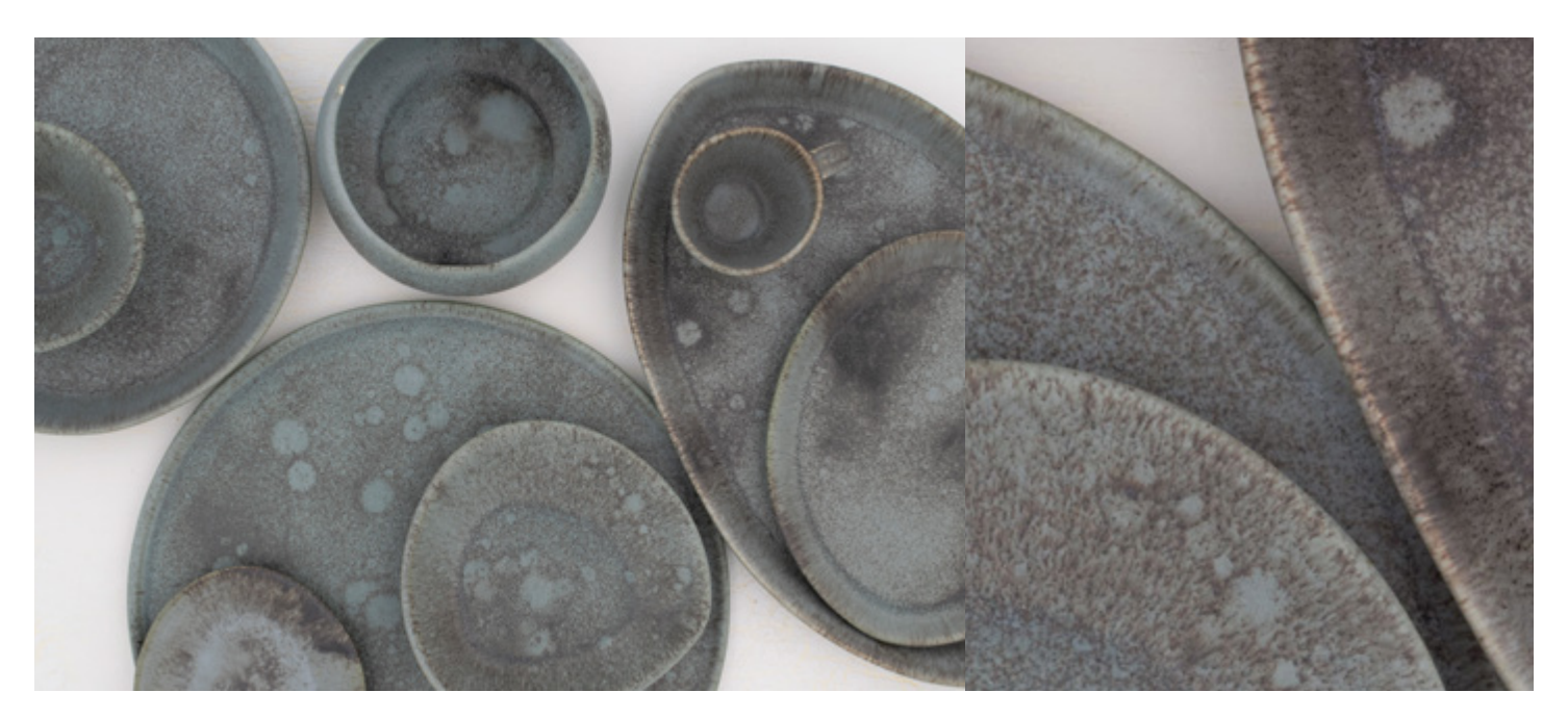
Concrete Variegated, Industrial

These signature colors are distinctive, unique, and are designed to pop on any tabletop.