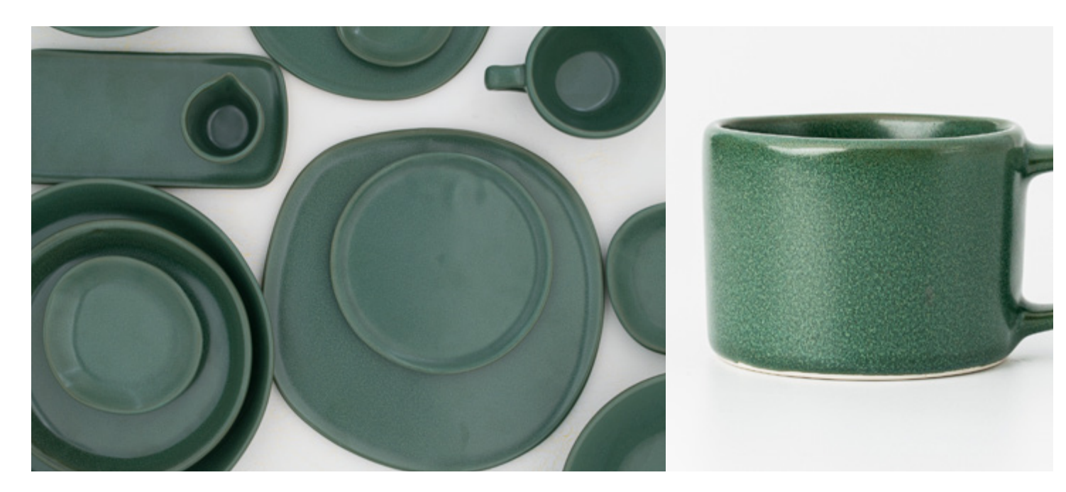
Fern Lush, botanical, sumptuous