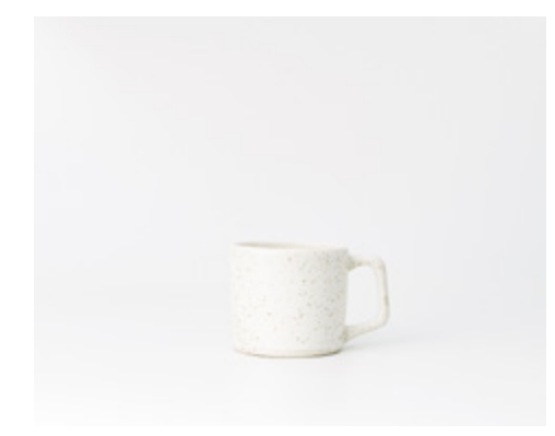
8 oz. Coffee Mug 3.5" diameter x 3" height Item no. 02-06-09 / M-Short-S-8 oz. Pictured in Birch