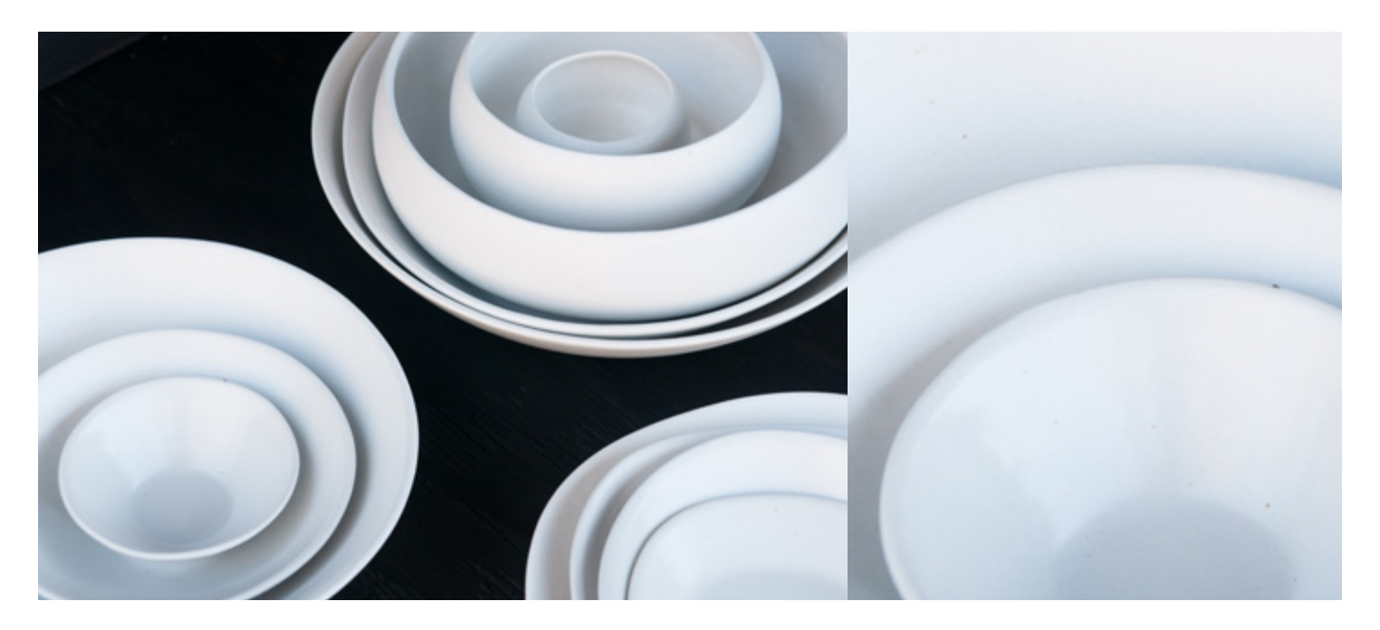
Gloss White Classic, fresh, plush

Due to manufacturing considerations, these finishes require a longer lead time. Contact us for current lead times.