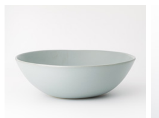
90 oz. Serving Bowl 11.25" diameter x 3.5" height Item no. 03-03-12 / SB-M Pictured in Grey

Named after the Greek goddess of the hearth, the Hestia Collection is homey, relaxed and classical, with the hand and the hearth springing to mind the moment you touch them.