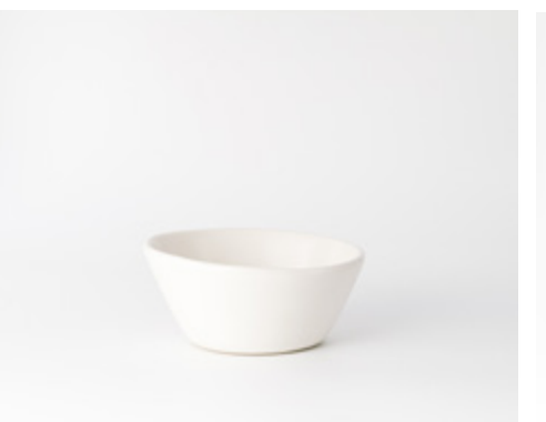
12 oz. Bowl 6" diameter x 3" height Item no. 02-03-12 / SDB-M-12 oz. Pictured in White