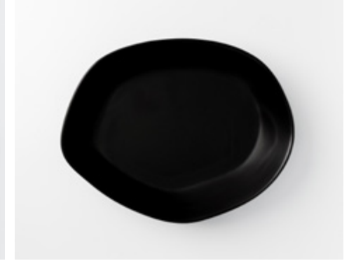
13.5" Deep Platter

14.5" wide x 1" long, .75" lip Item no. 03-07-14 / PL-Skinny-M Pictured in Birch