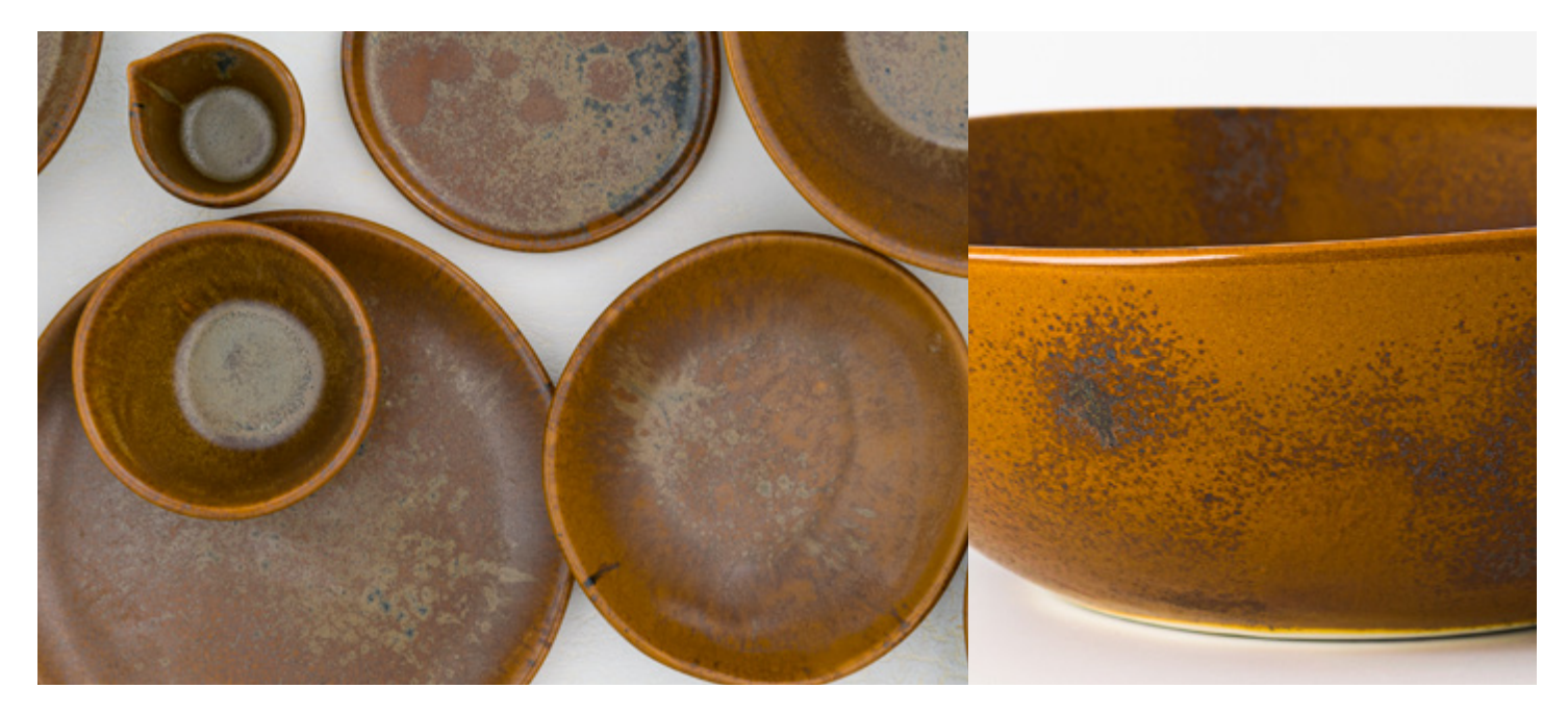
Burl Earthy, inviting, unique