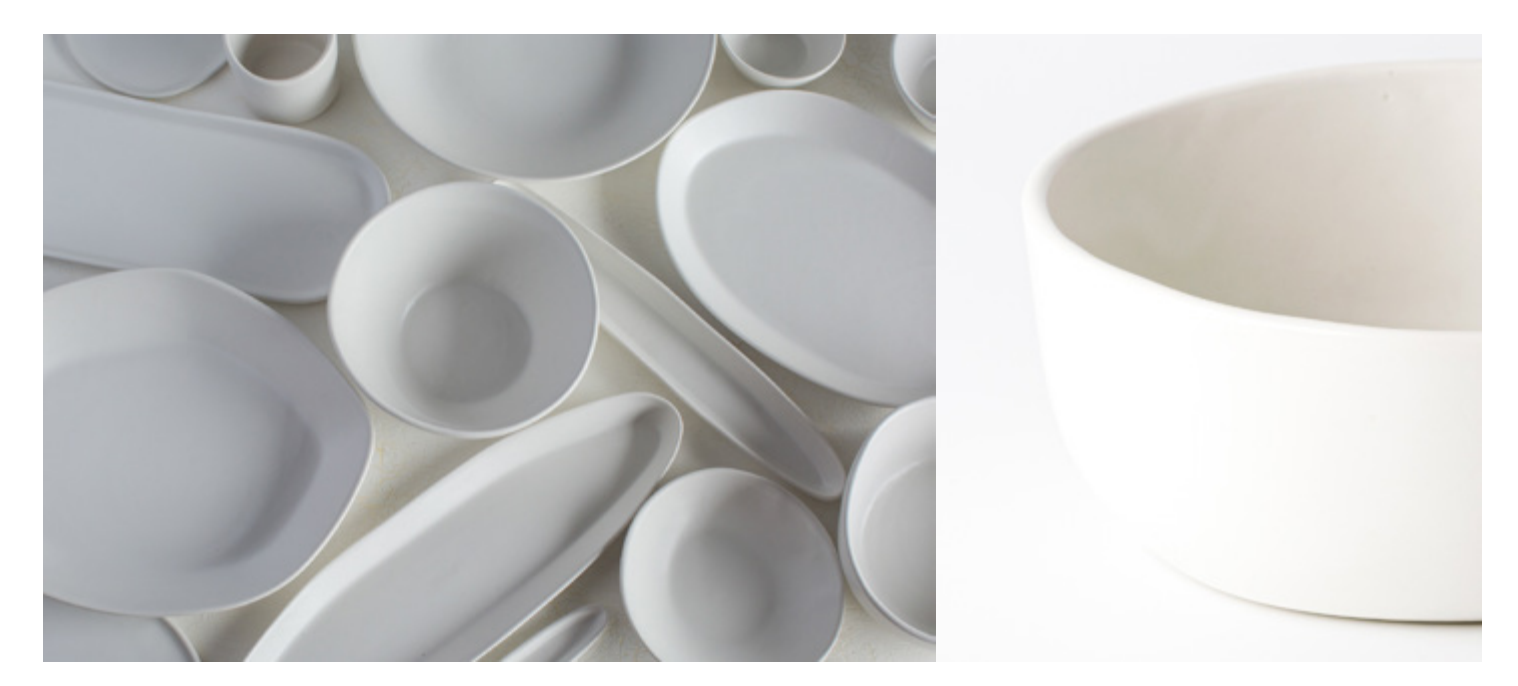
White Clean, crisp, classic

Our satin white is simple at first glance, but looking deeper reveals hidden depths and variation, like a beautiful fragment of Greek marble or a sheet of handmade paper intended for a 19th century manuscript.