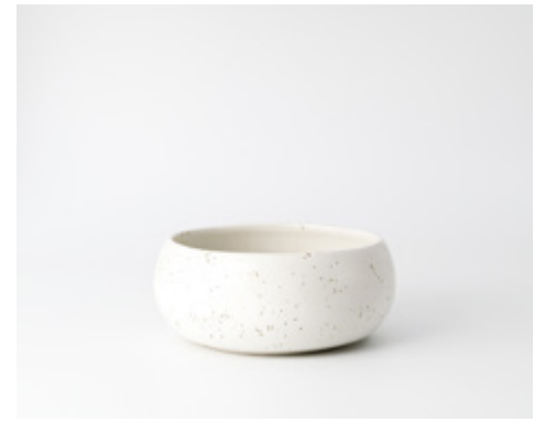
25 oz. Bowl

11" wide x 4" long Item no. 03-05-11 / Rec. Tray 11" Pictured in Fern