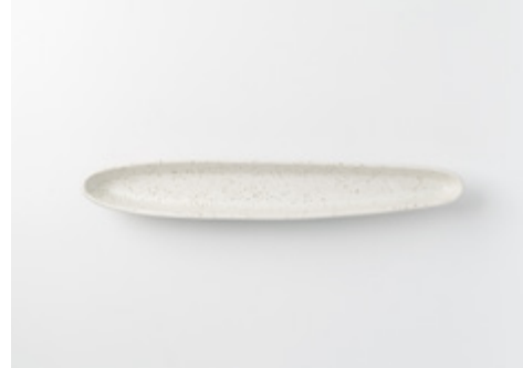
14" Skinny Platter

15.5" wide x 5" long, .75" lip Item no. 03-07-15 / PL-Skinny-L Pictured in White