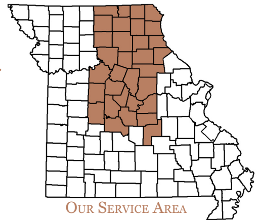
OUR SERVICE AREA

Randolph.....1,272,808 lbs. Cherith Brook Pantry 672,492 Christos Center 425,484 Community Kitchen 12,784