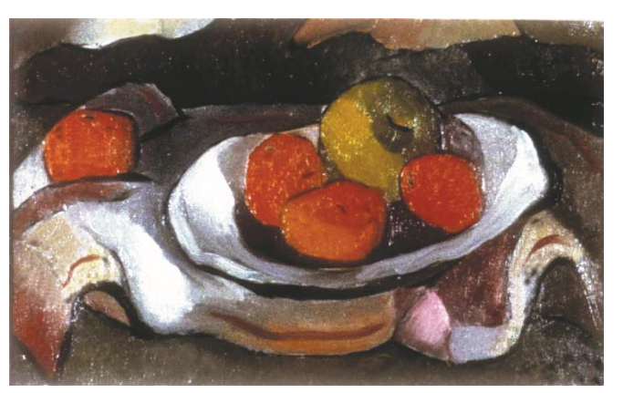
Fred Noyes, Tangerines, oil