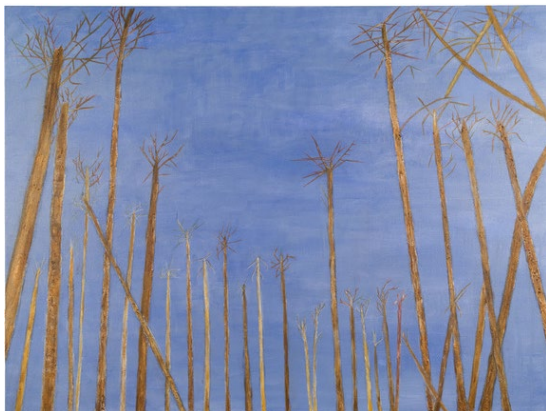
Pamela Tudor, Ghost Forest 2 , Acrylic on canvas