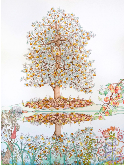
Michael Eade, Tree of Life Reflected , 2018. Egg tempera, raised 22k gold leaf, raised aluminum leaf, oil on canvas, 48 x 36 inches ©Michael Eade, courtesy Fou Gallery