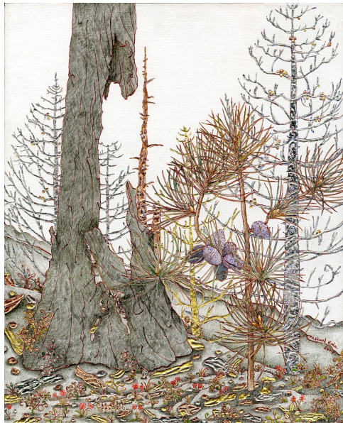
Michael Eade, Pine Tree Sapling (Small) , 2019. Egg tempera, raised 22k gold leaf, raised copper and aluminum leaf on wood panel, 17.1 x 13.8 inches ©Michael Eade, courtesy Fou Gallery