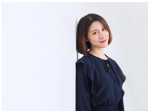
Liang Hai ©Liang Hai