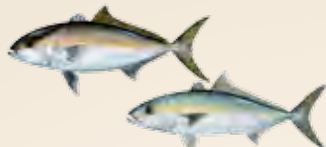
Amberjack, Lesser & Banded Rudderfish ▲●