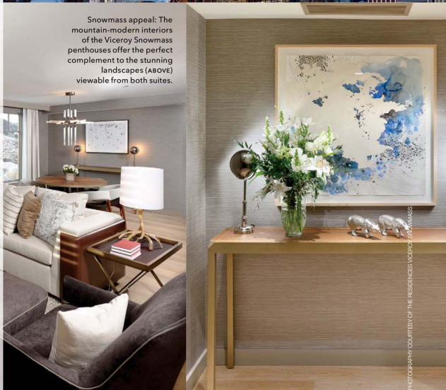
Snowmass appeal: The mountain-modern interiors of the Viceroy Snowmass penthouses offer the perfect complement to the stunning landscapes (ABOVE) viewable from both suites.