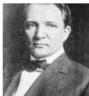
Col. RAYMOND ROBINS