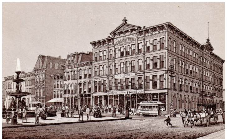
SE corner 4th and Main Sts, Zanesville, 1888.

If you shop at Kroger and you have a Kroger Plus Shopper's Card, you can direct Kroger to share Community Rewards with Muskingum County History at no cost to you. Go to Kroger.com and click on "Kroger Community Rewards" at the bottom of the page (or go directly there by using this address https://www.kroger.com/account/enrollCommunityRewardsNow ) and sign in or create an account. You can then link your Shopper's Card to us by using our number, 80971, or searching for "Pioneer & Historical Soc. Muskingum Co." (our former, but still legal name). After that, every time you spend money at Kroger we receive a credit and every quarter we are issued a check. The price of your groceries does not change and we do not receive any notice of who is participating or what they are purchasing. We receive free money with no strings attached and you get a warm feeling knowing that you have justified your spending on cheese doodles and Double Stuf Oreos by serving the community. After we made this same appeal to our Facebook friends in December participation increased three-fold and we hope to reach even more of you now. Free money is hard to find these days, please help us get our share.