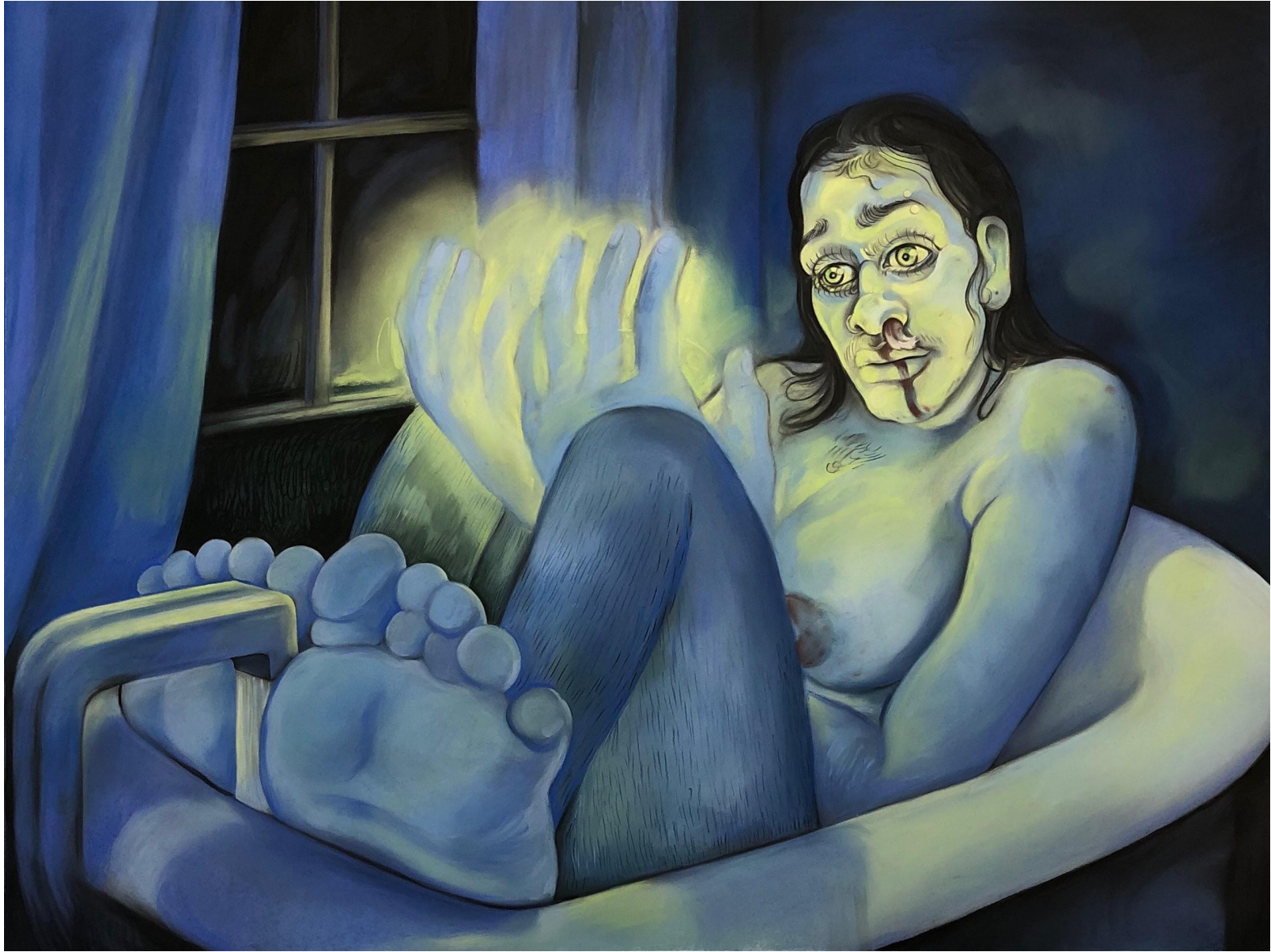
Alina Perez Luna Moth , 2019 Charcoal and pastel on paper 38 × 50 inches