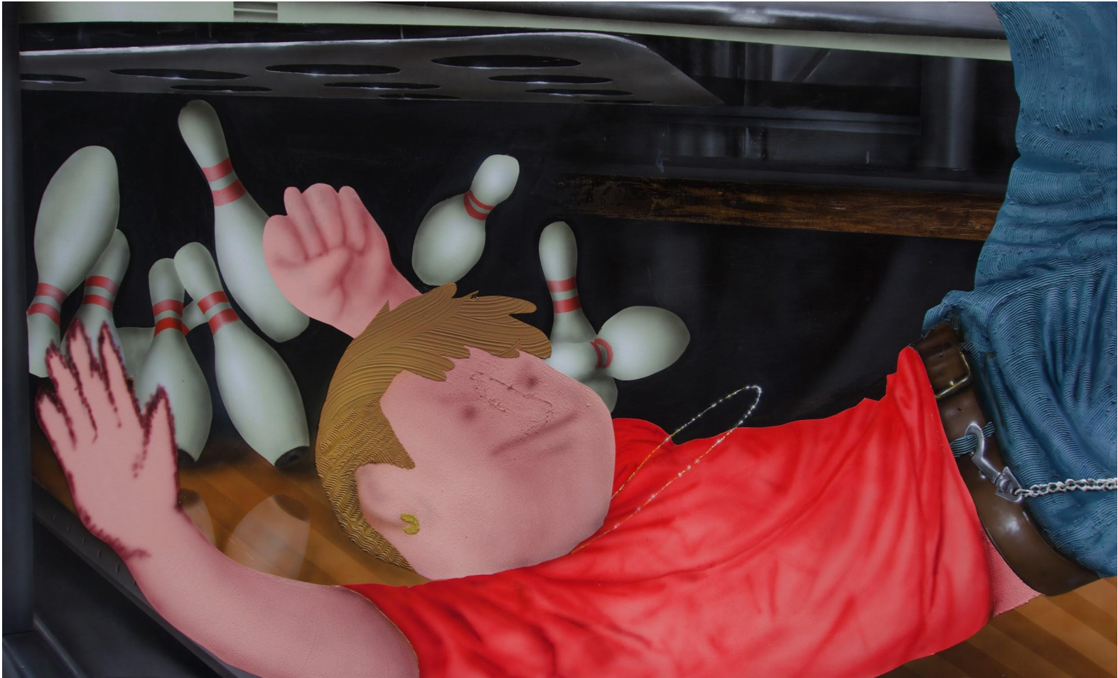
Trey Abdella Strike , 2019 Acrylic on canvas 36 x 60 inches