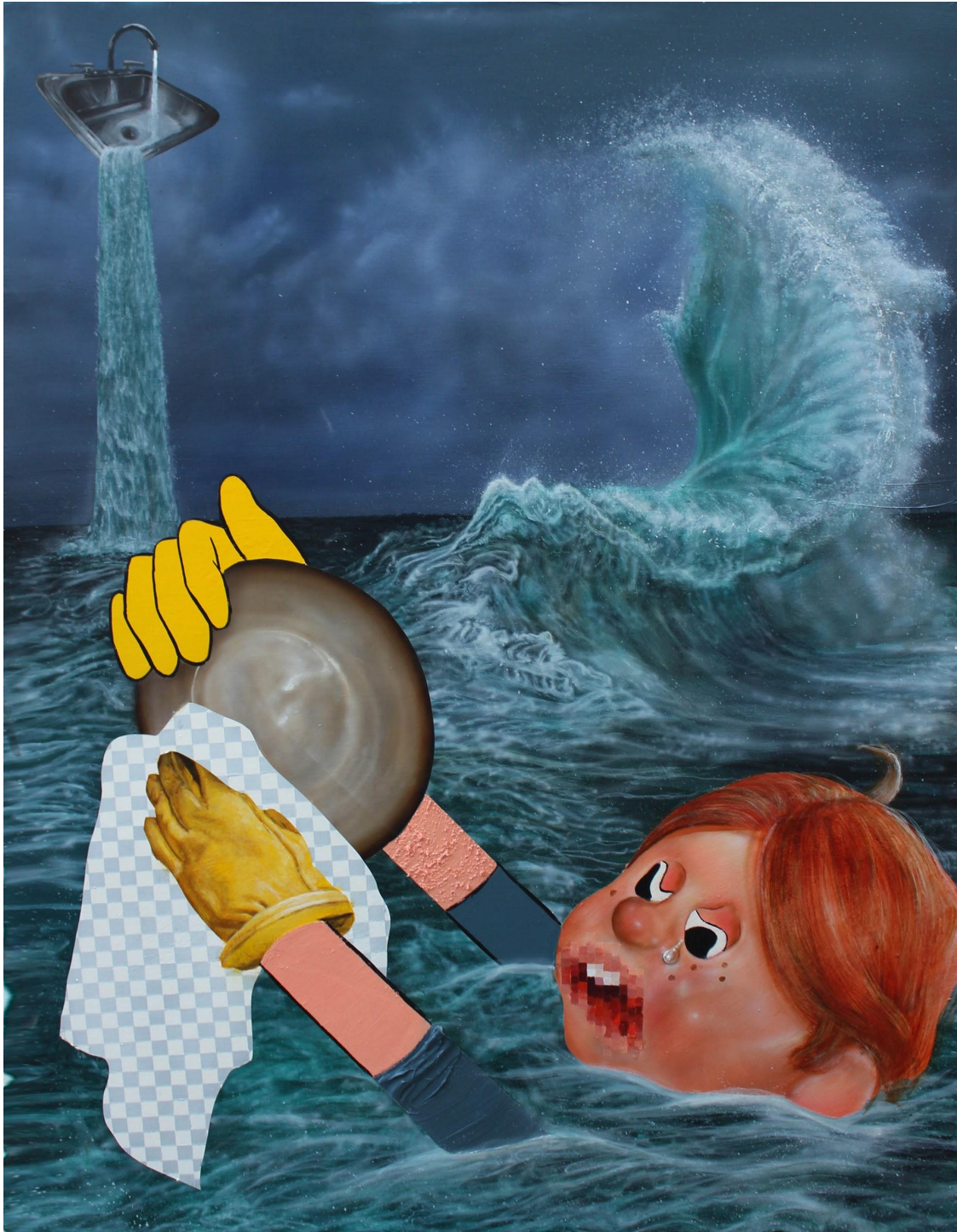
Trey Abdella I Don't Wanna Do The Dishes, 2018 Acrylic on canvas 40 x 30 inches