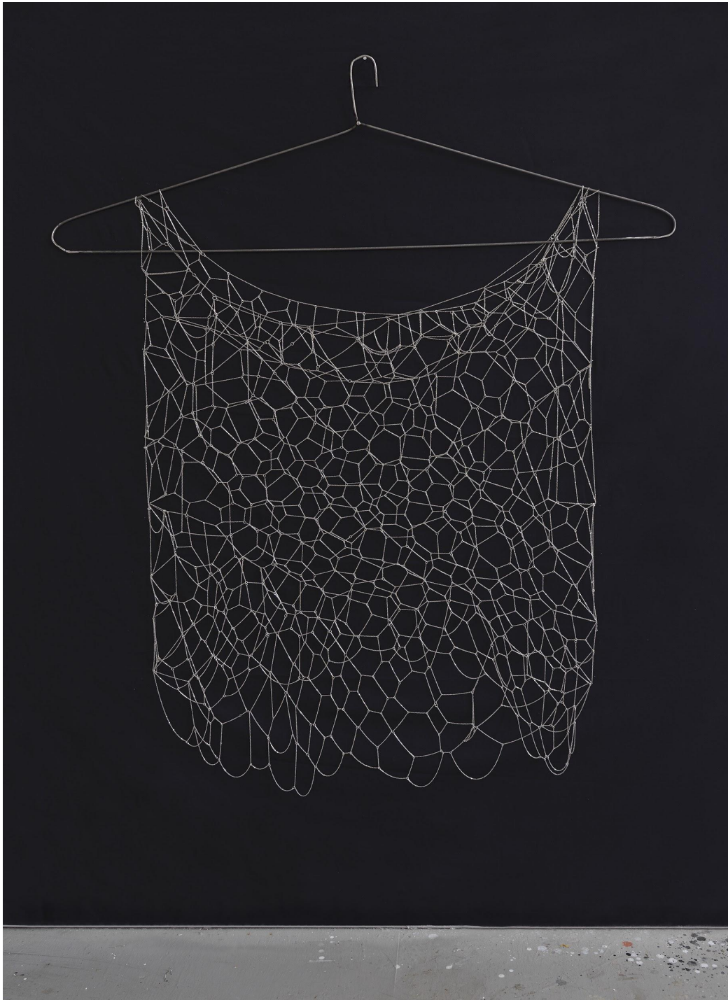
EunJung Park Hold, 2017 Steel, necklace chains, ring 70 x 60 inches