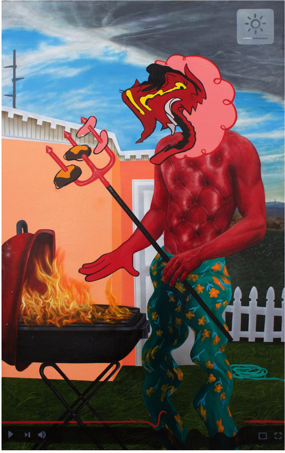
Trey Abdella Backyard BBQ, 2018 Acrylic on canvas 62h x 39w inches