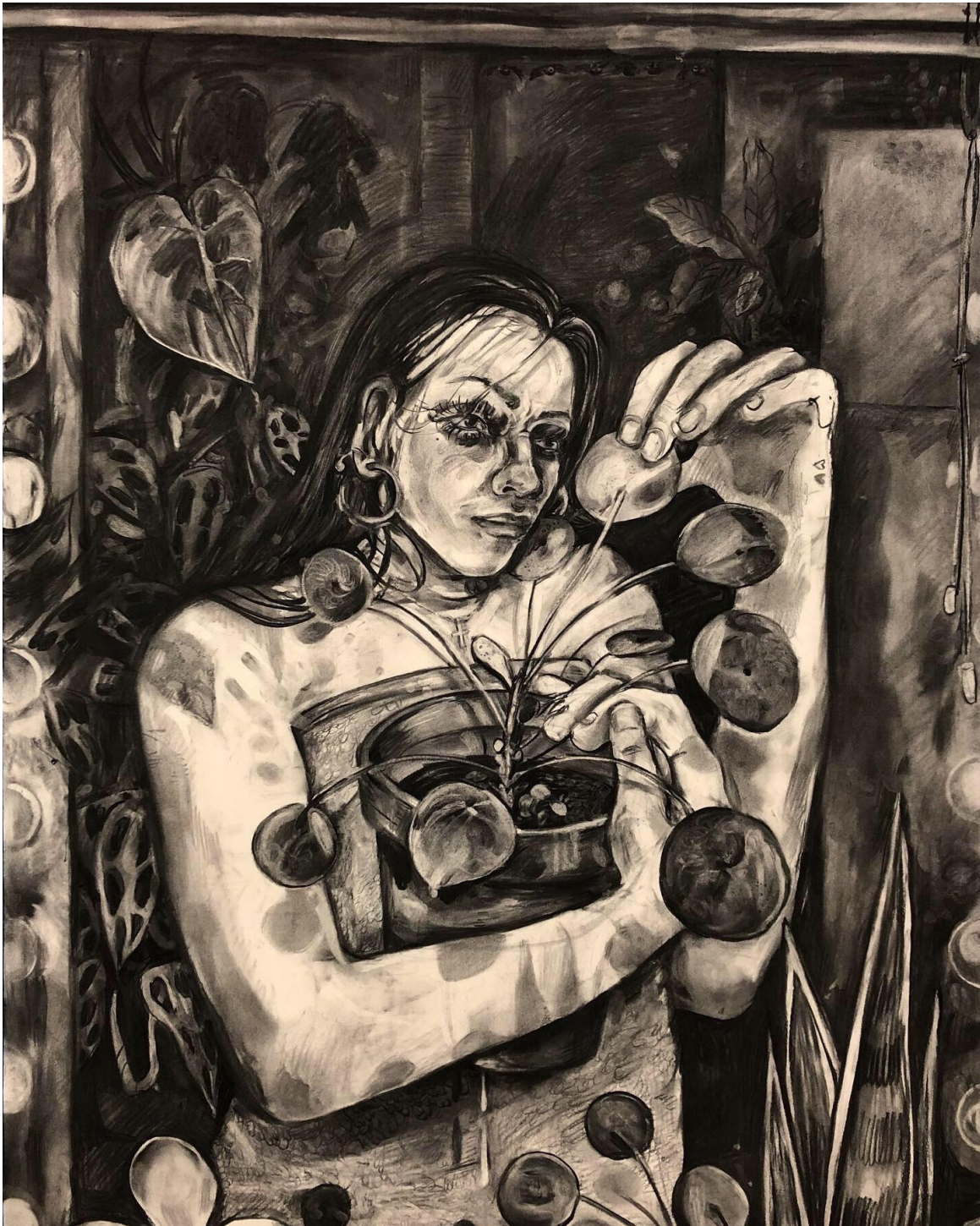
Alina Perez Pilea Kingdom, 2019 Charcoal on paper 50 x 38 inches