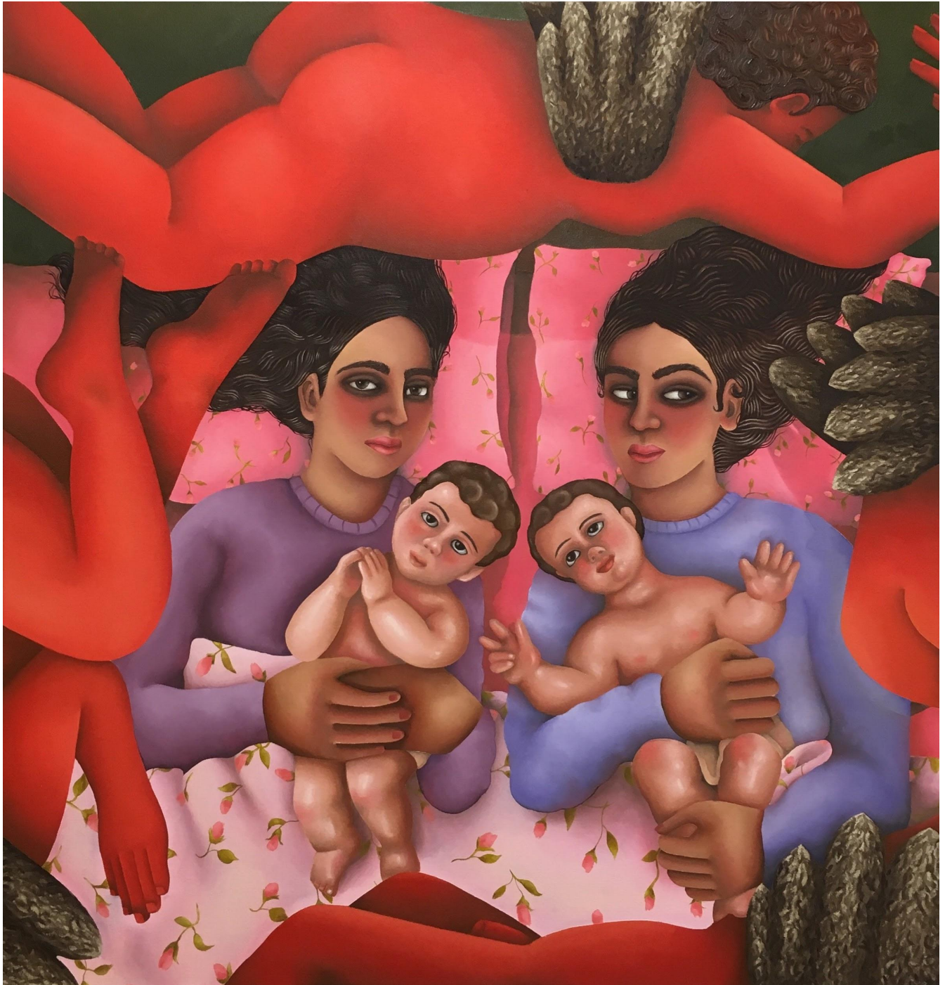
Maria Fragoso De nuestro jardín de frutas falsas, 2018 Oil on canvas 42 x 40 inches