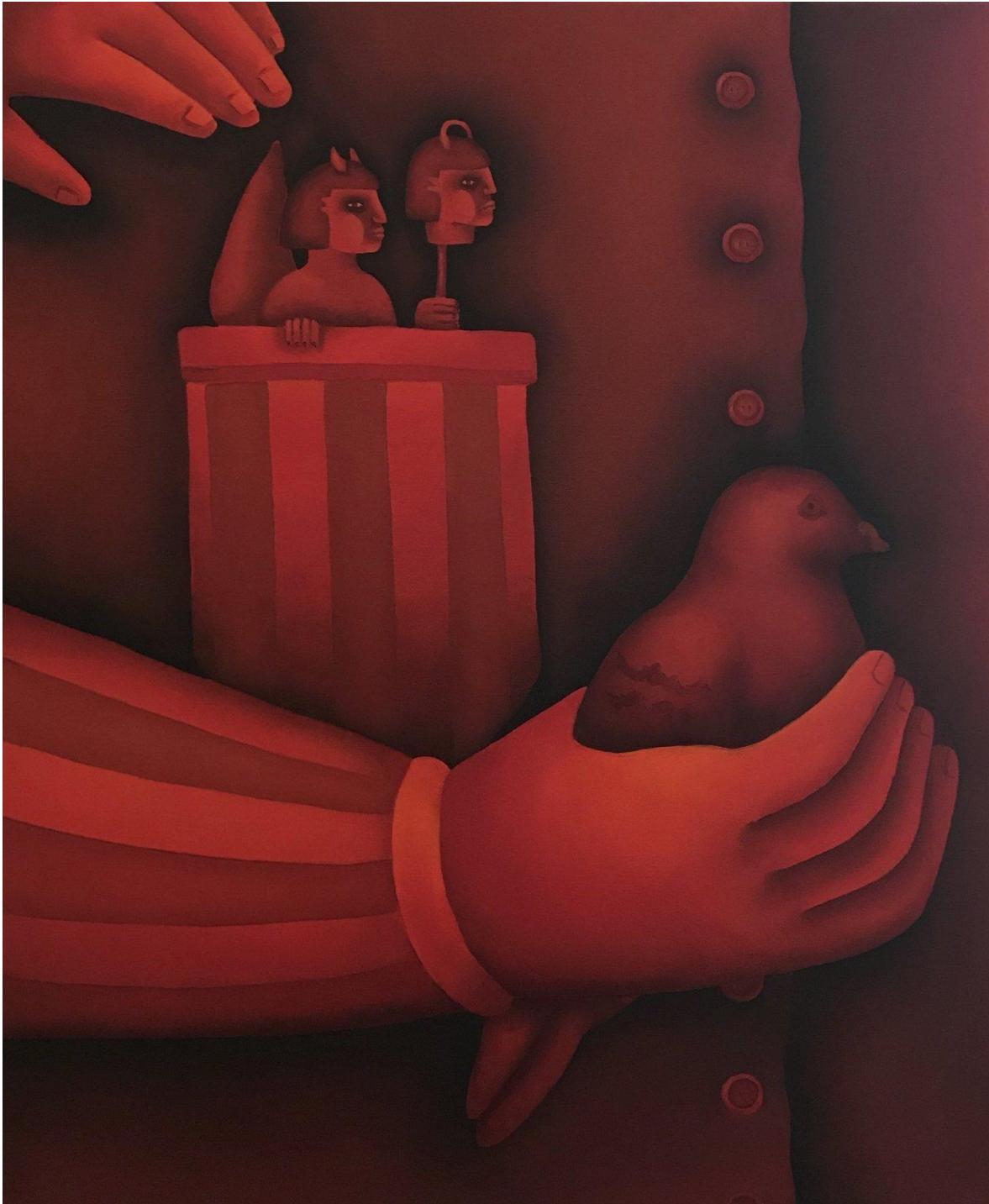
Maria Fragoso De lo bueno y lo malo , 2018 Oil on canvas 24 x 20 inches