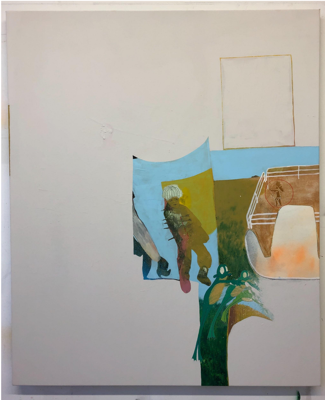
Casey Bolding Caseys Cross , 2019 Acrylic, oil, and paper on canvas 46 x 38 inches