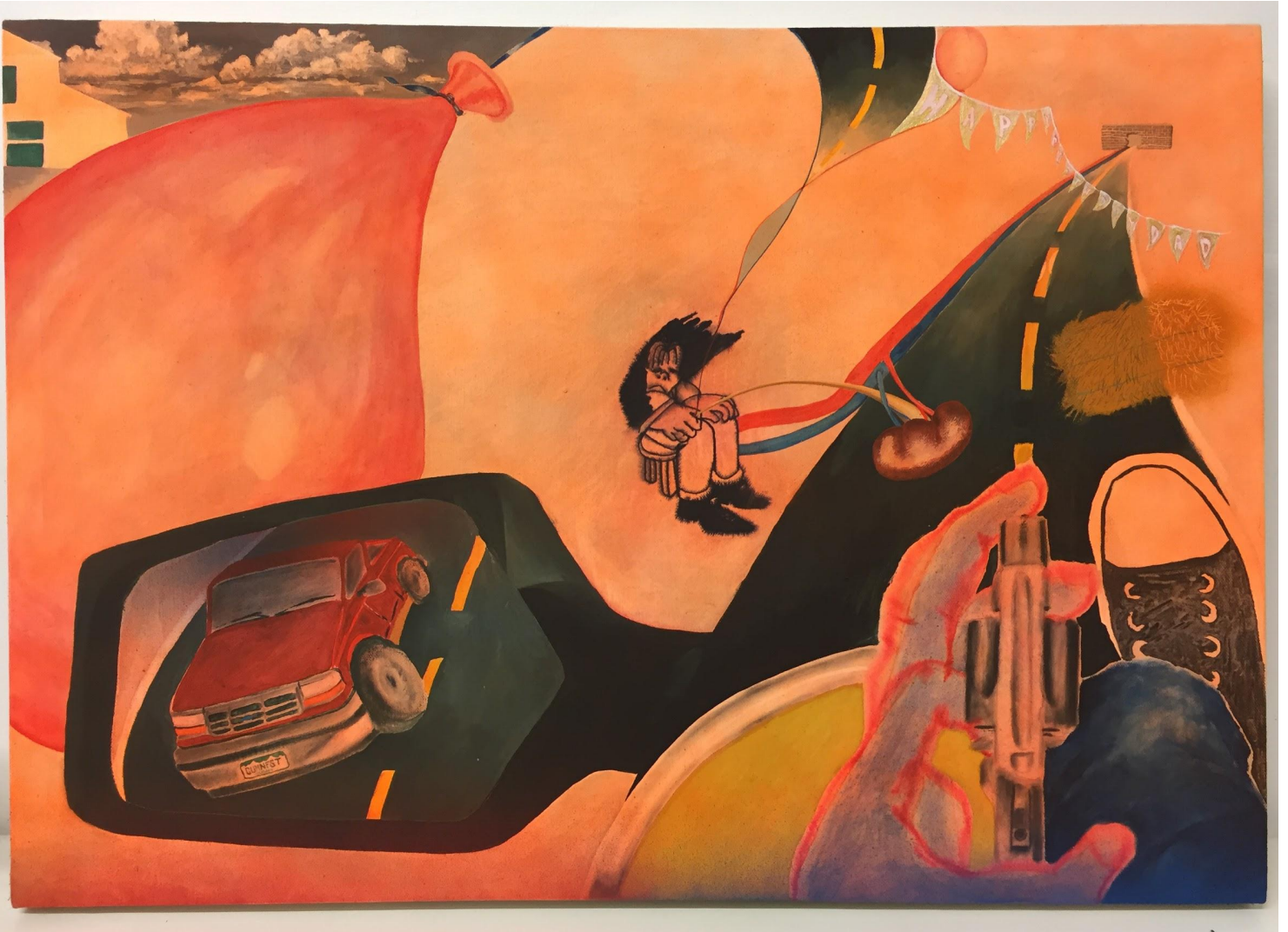
Casey Bolding Gun Club Road , 2019 Acrylic, oil, and charcoal on canvas 19 x 27 inches