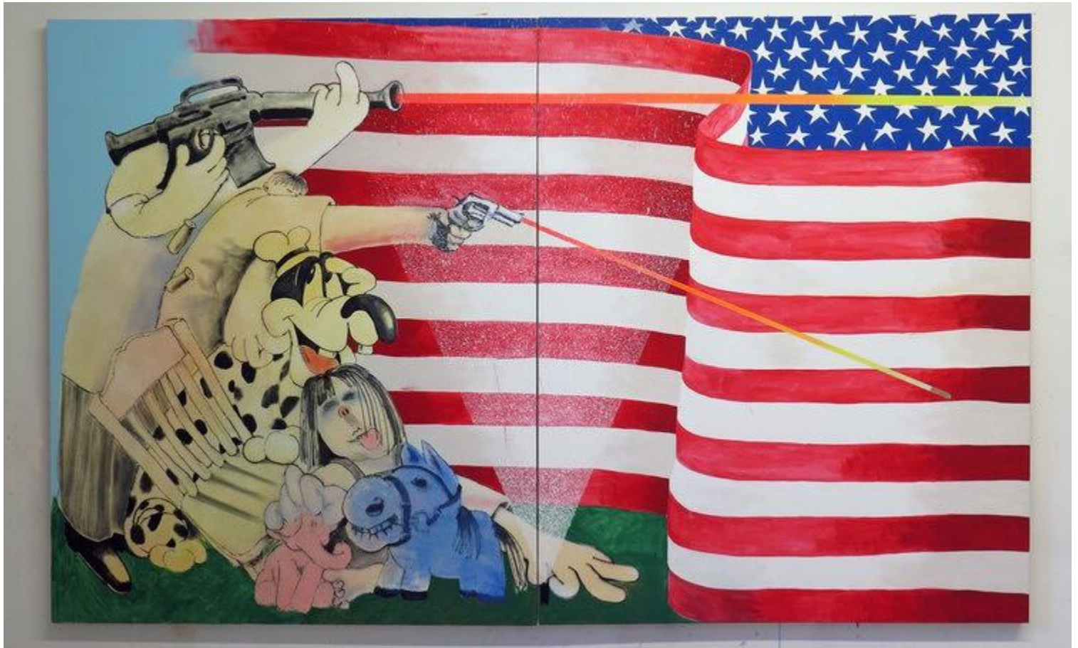
Casey Bolding Sorry about your Hat, 2019 Acrylic and chalk on canvas 60 x 96 inches