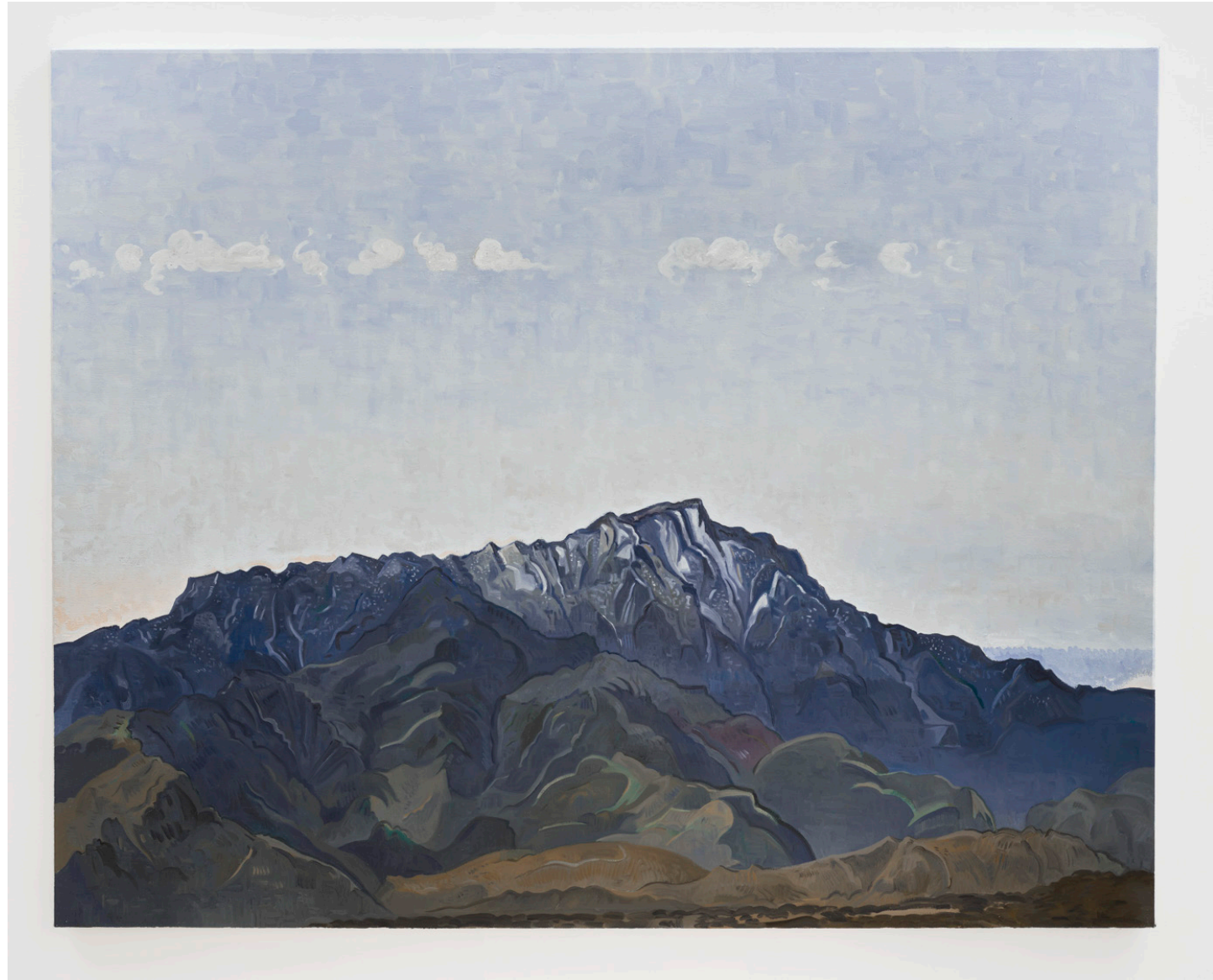
Aaron Zulpo | San Jacinto Mountains , 2024 oil on canvas | 48h x 60w inches