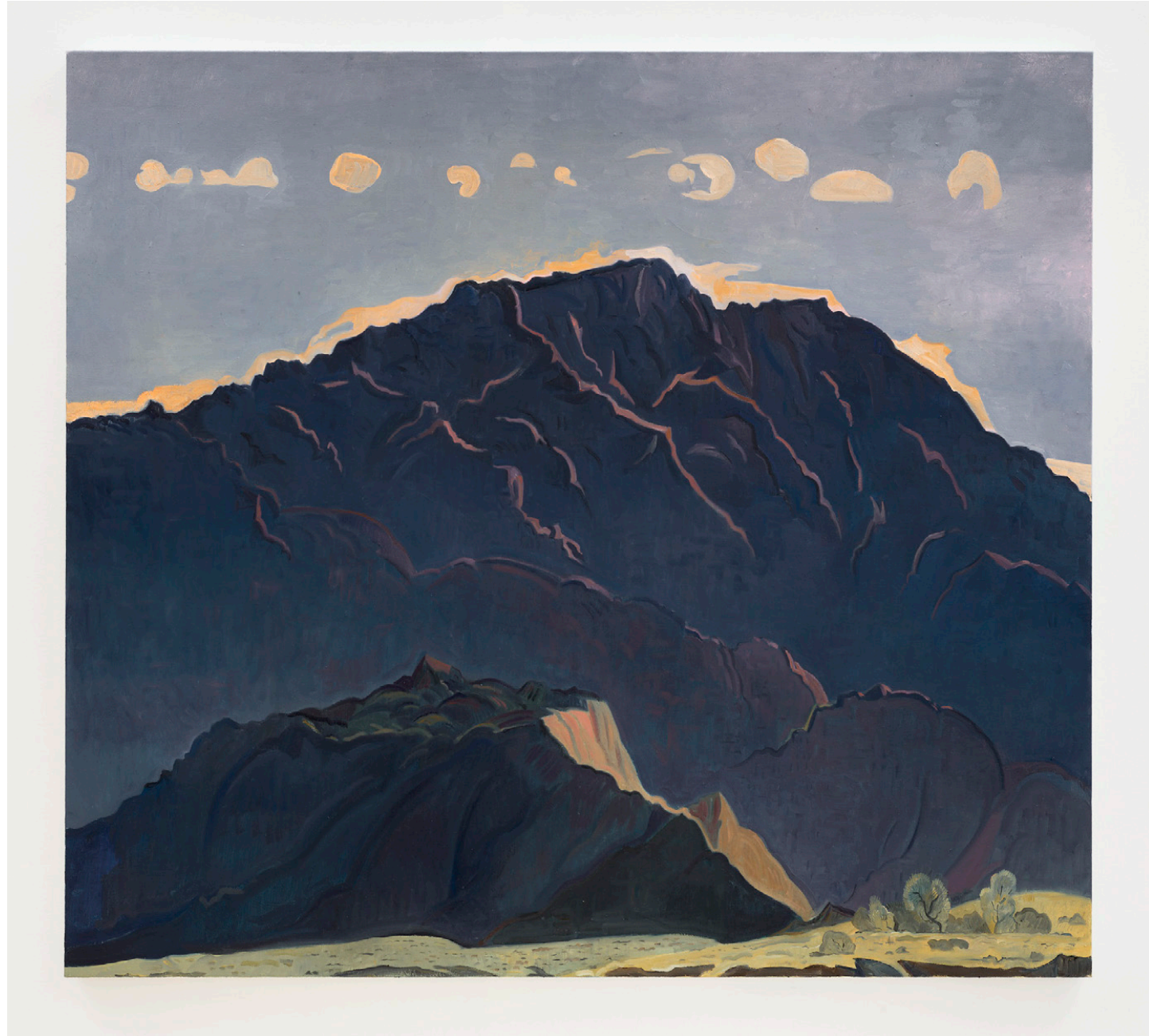
Aaron Zulpo | San Jacinto Peak , 2024 oil on canvas | 45h x 50w inches