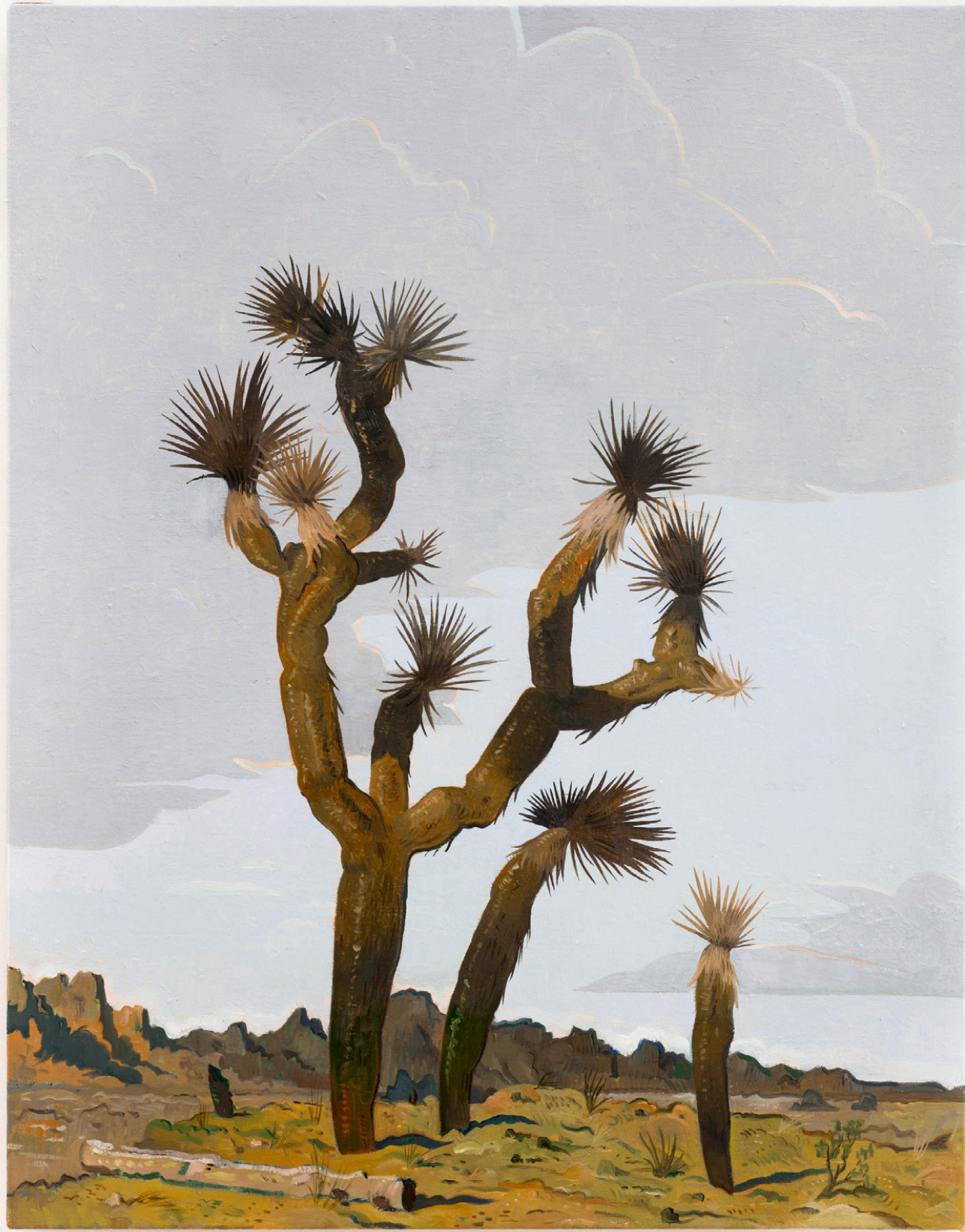
Aaron Zulpo | Horseshoe Joshua Tree , 2024 oil on canvas | 28h x 22w inches