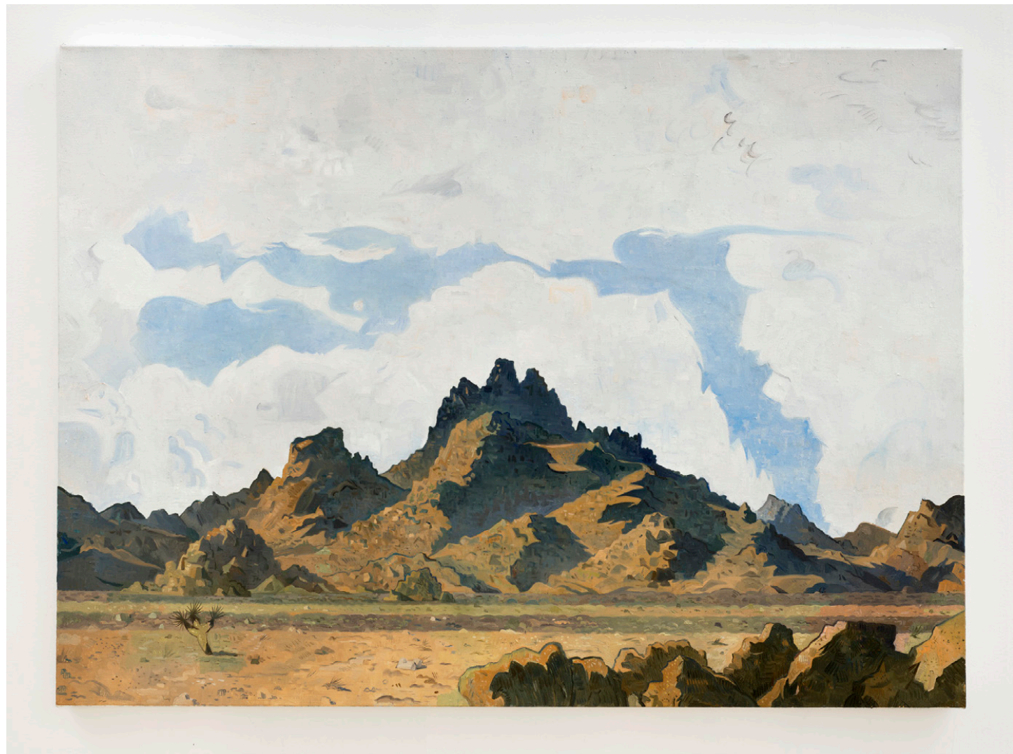
Aaron Zulpo | Looking at Maze Loop from Quail Springs, 2024 oil on canvas | 36h x 49w inches