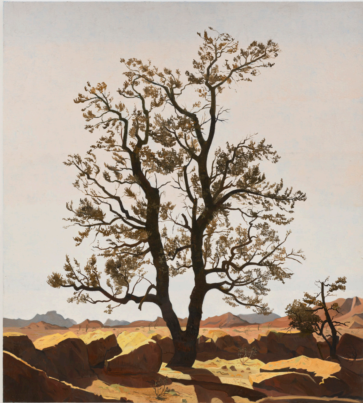
Aaron Zulpo | Desert Tree Next to The Oysters, JT National Park, 2024 oil on canvas | 40h x 36w inches