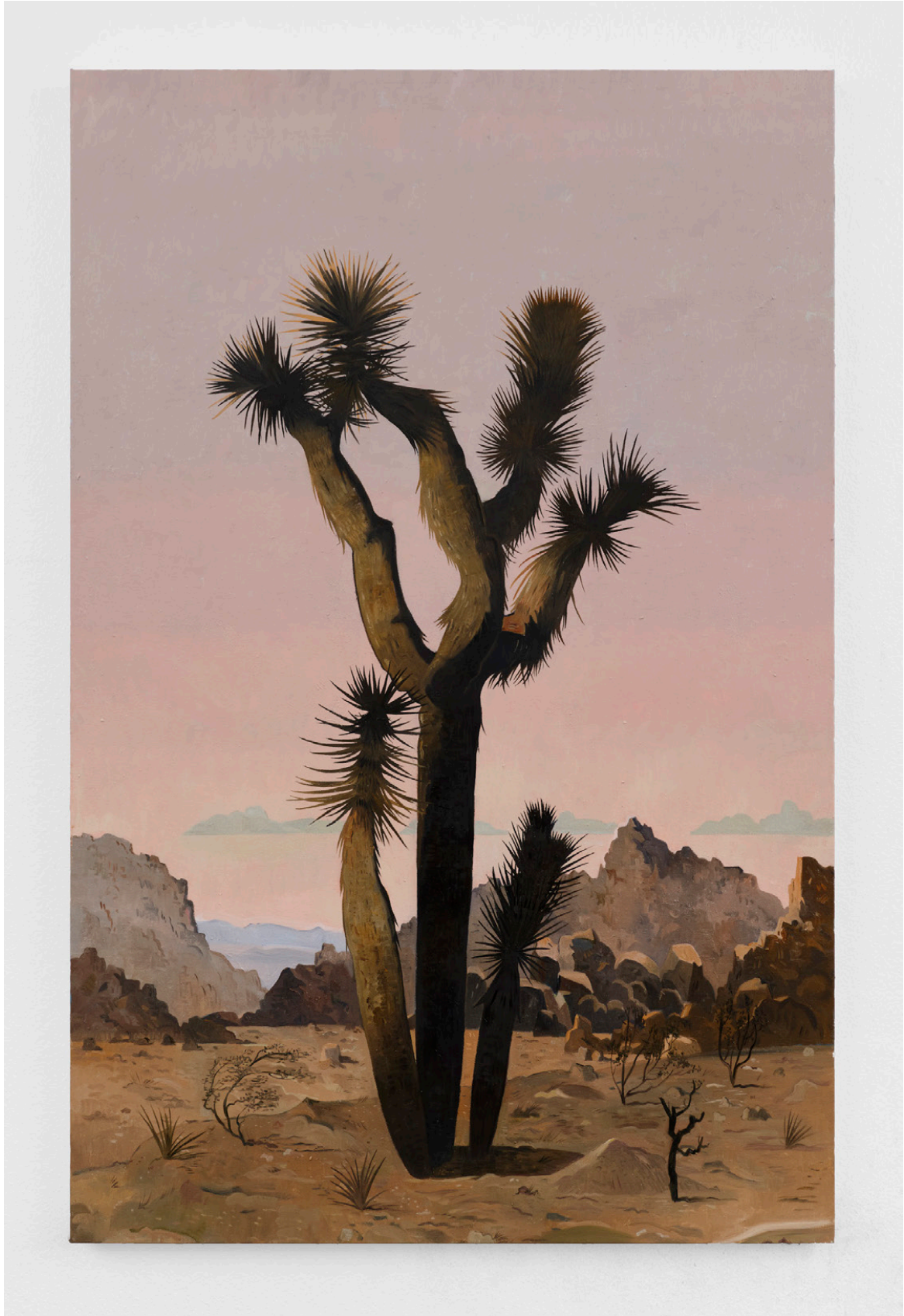
Aaron Zulpo | Maze Loop to Morongo Basin , 2024 oil on canvas | 60h x 39w inches