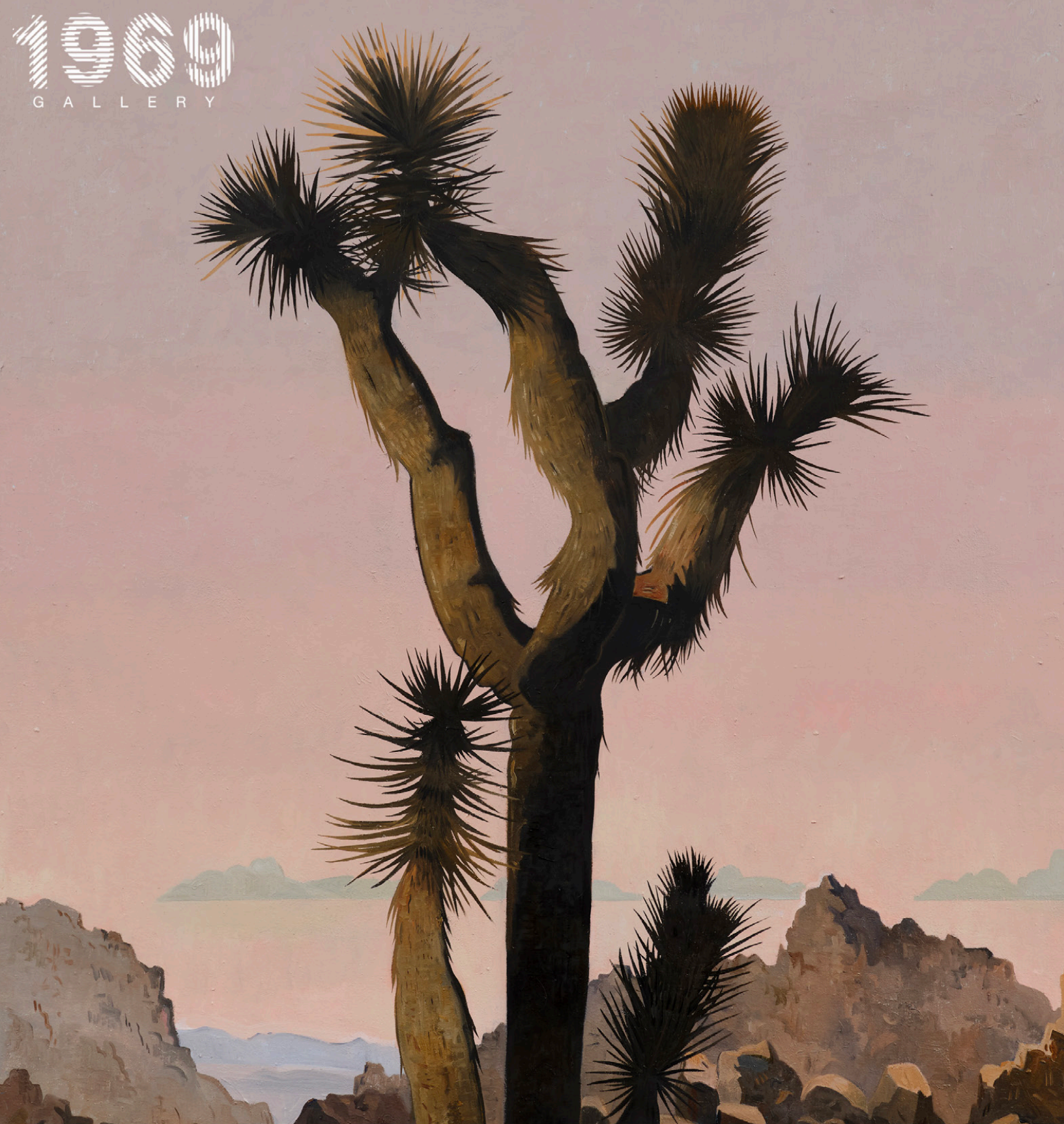
Aaron Zulpo | Maze Loop to Morongo Basin (detail), 2024 | oil on canvas | 60h x 39w inches