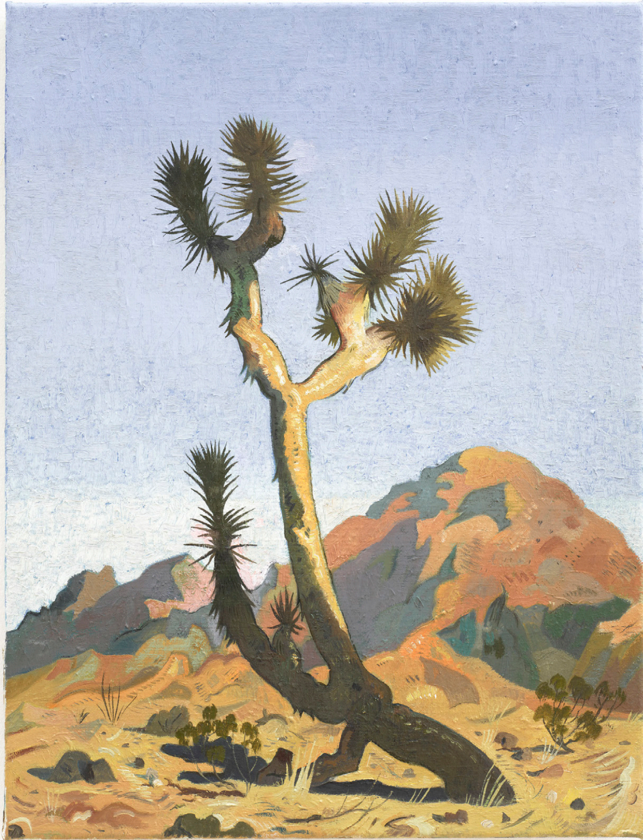
Aaron Zulpo | Joshua Tree near Quail Mountain , 2024 oil on canvas | 18h x 14w inches