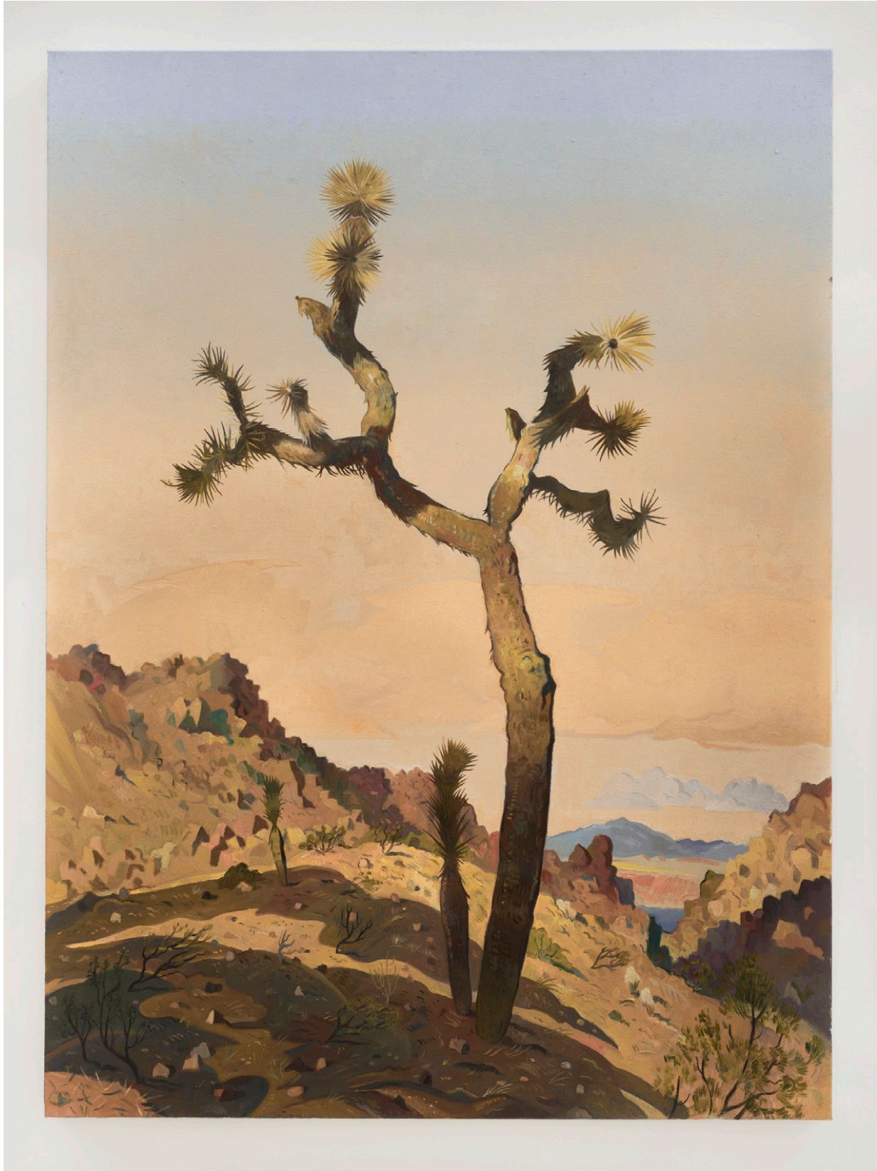
Aaron Zulpo | Joshua Tree at Maze Loop , 2024 oil on canvas | 40h x 24w inches