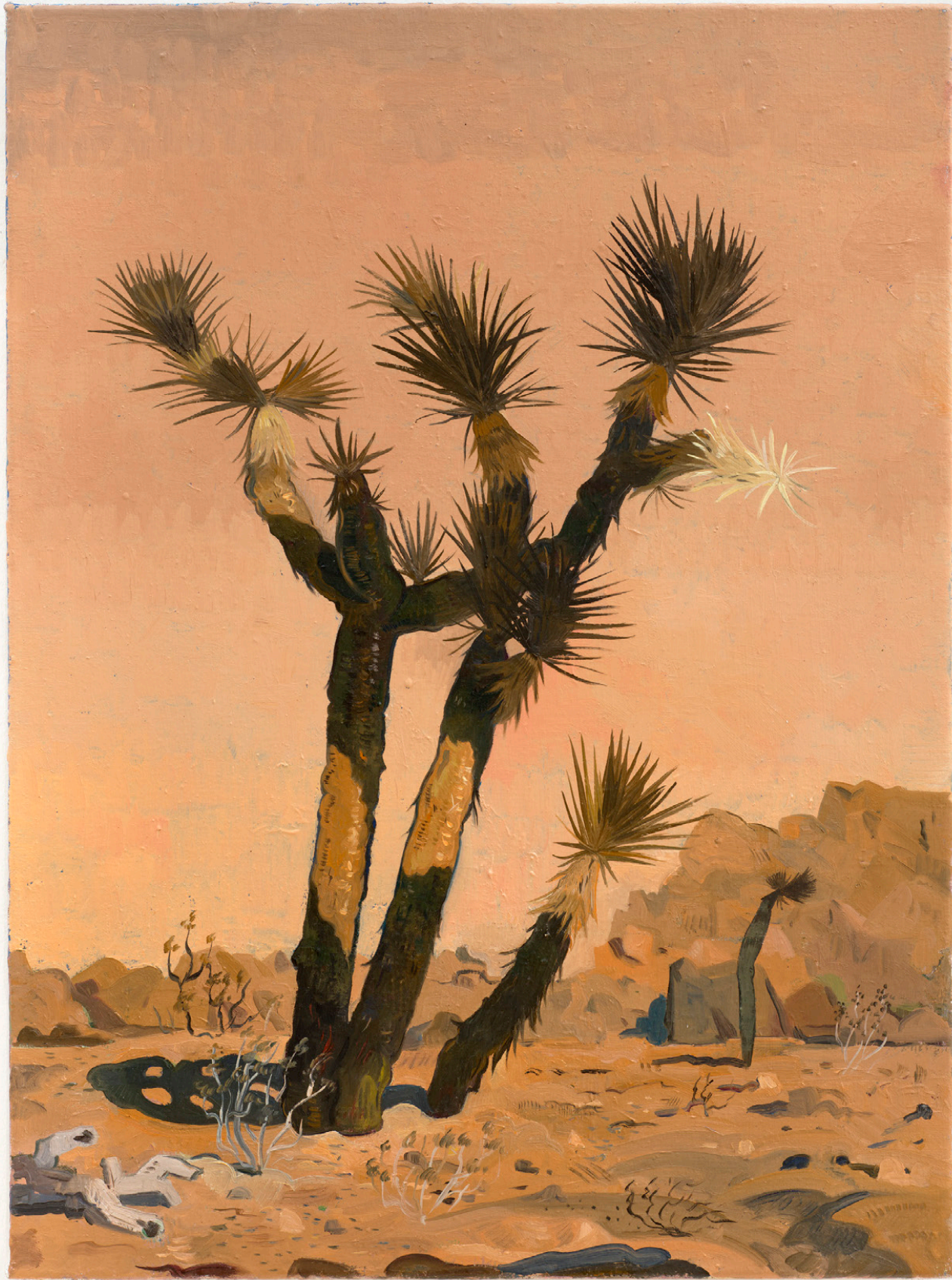
Aaron Zulpo | Joshua Tree with a Red Sky , 2024 oil on canvas | 20h x 15w inches