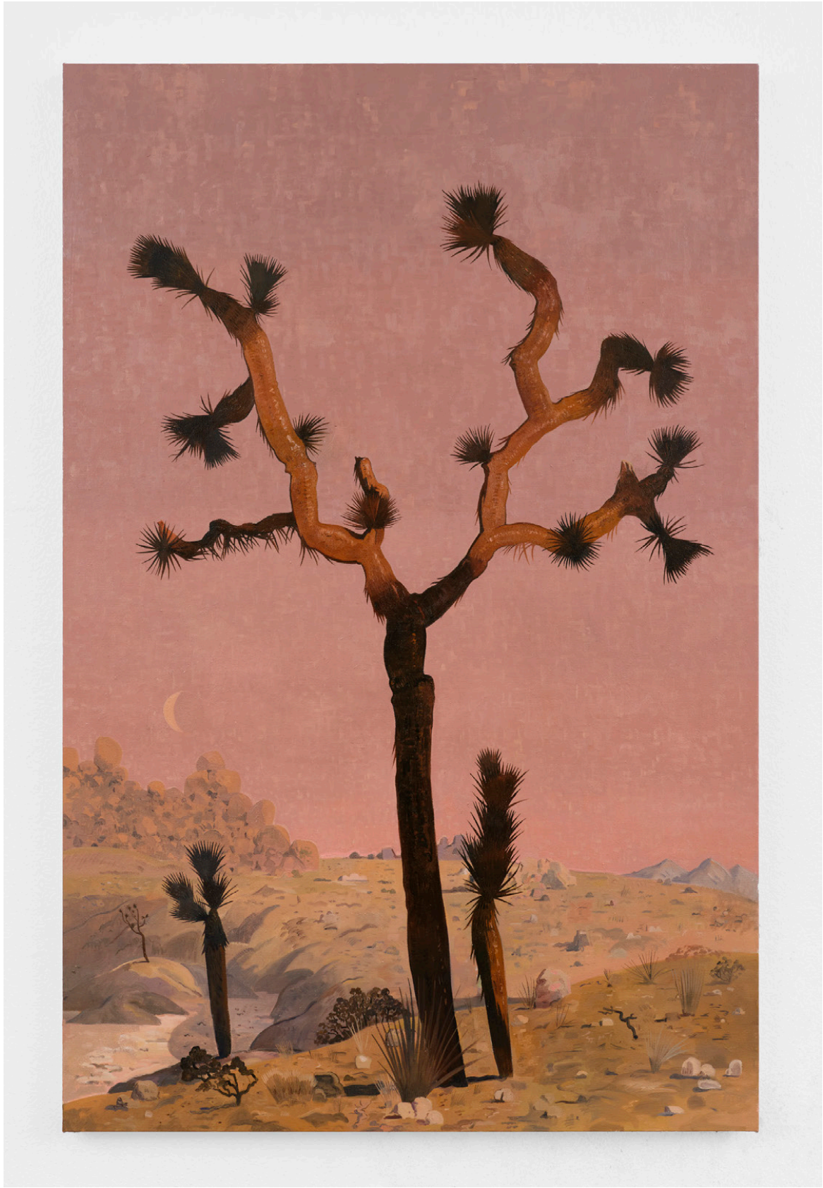
Aaron Zulpo | Quail Mountain Dust Storm , 2024 oil on canvas | 60h x 39w inches