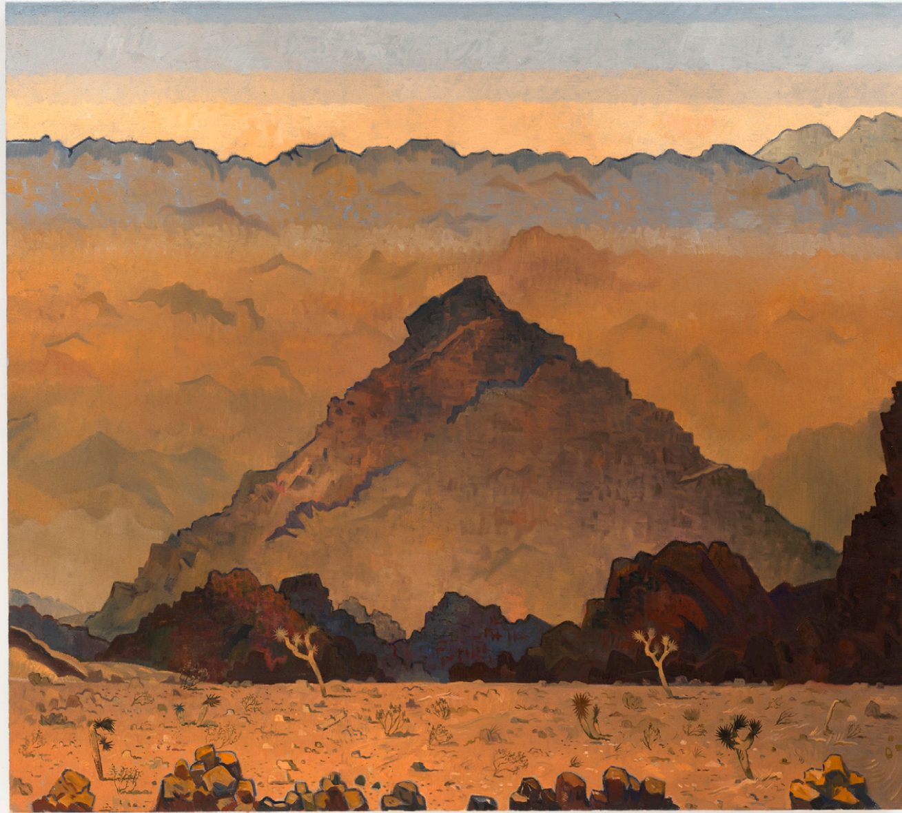
Aaron Zulpo | Looking towards Nolina Peak at Sunset, 2024 oil on canvas | 36h x 40w inches