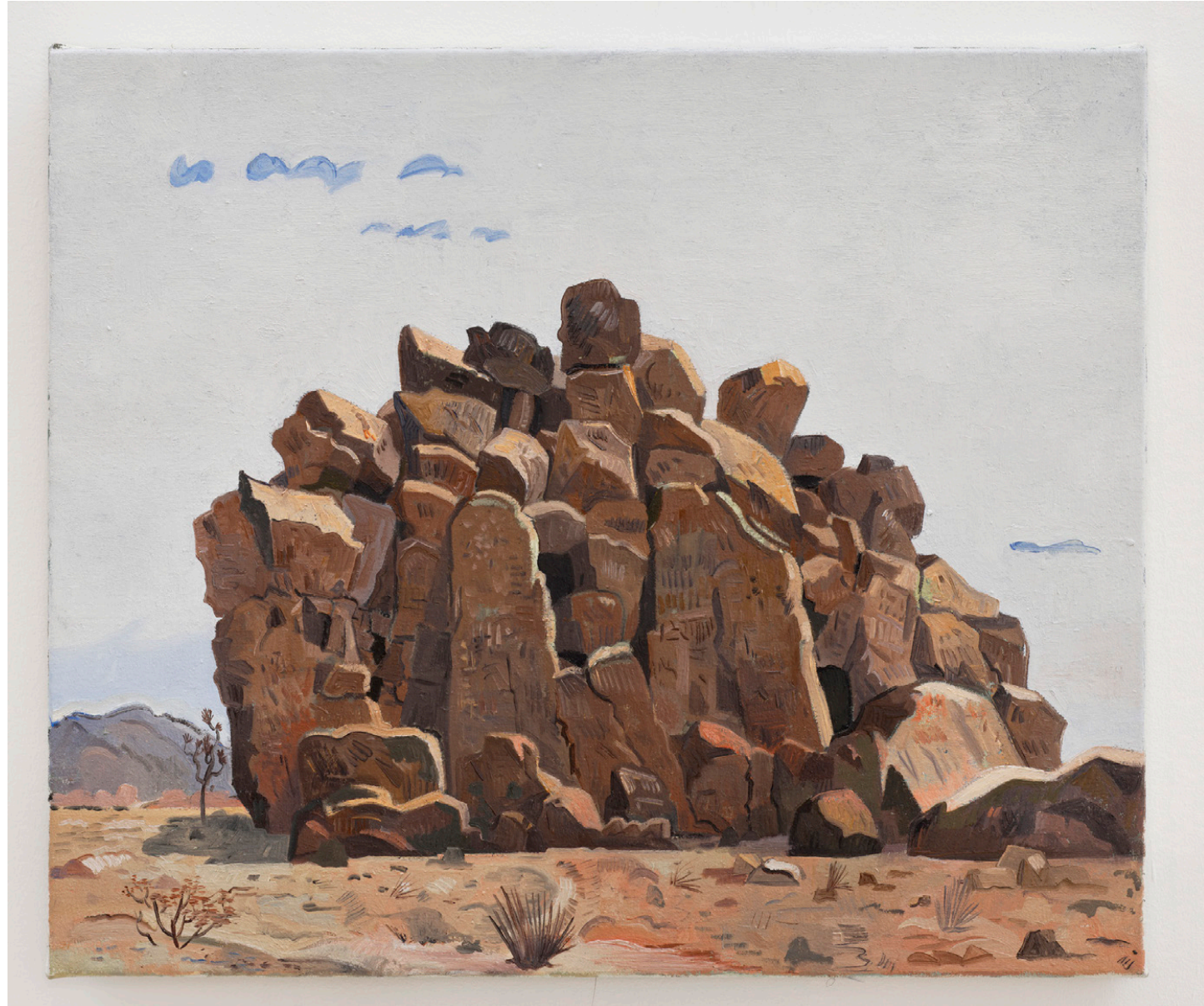
Aaron Zulpo | Hidden Valley Boulders , 2024 oil on canvas | 17h x 20w inches