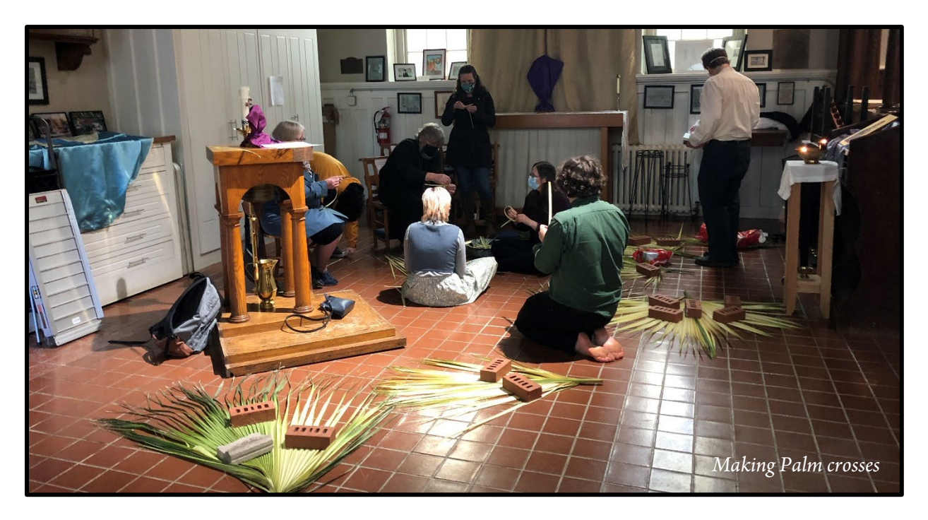
Accomplishments & Events this year:

'tablecloths' are ironed and rolled on to cardboard tubes to prevent creases. For the detail-oriented, this is satisfying work!