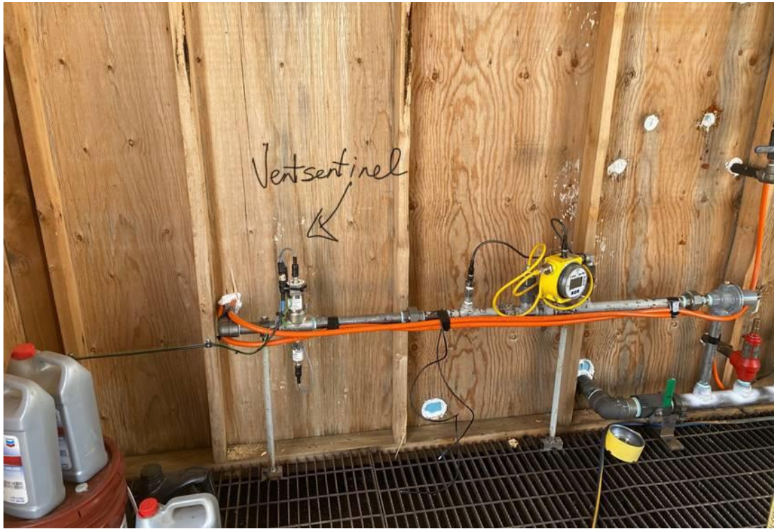
Figure 2. Ventsentinel® unit, field trials.