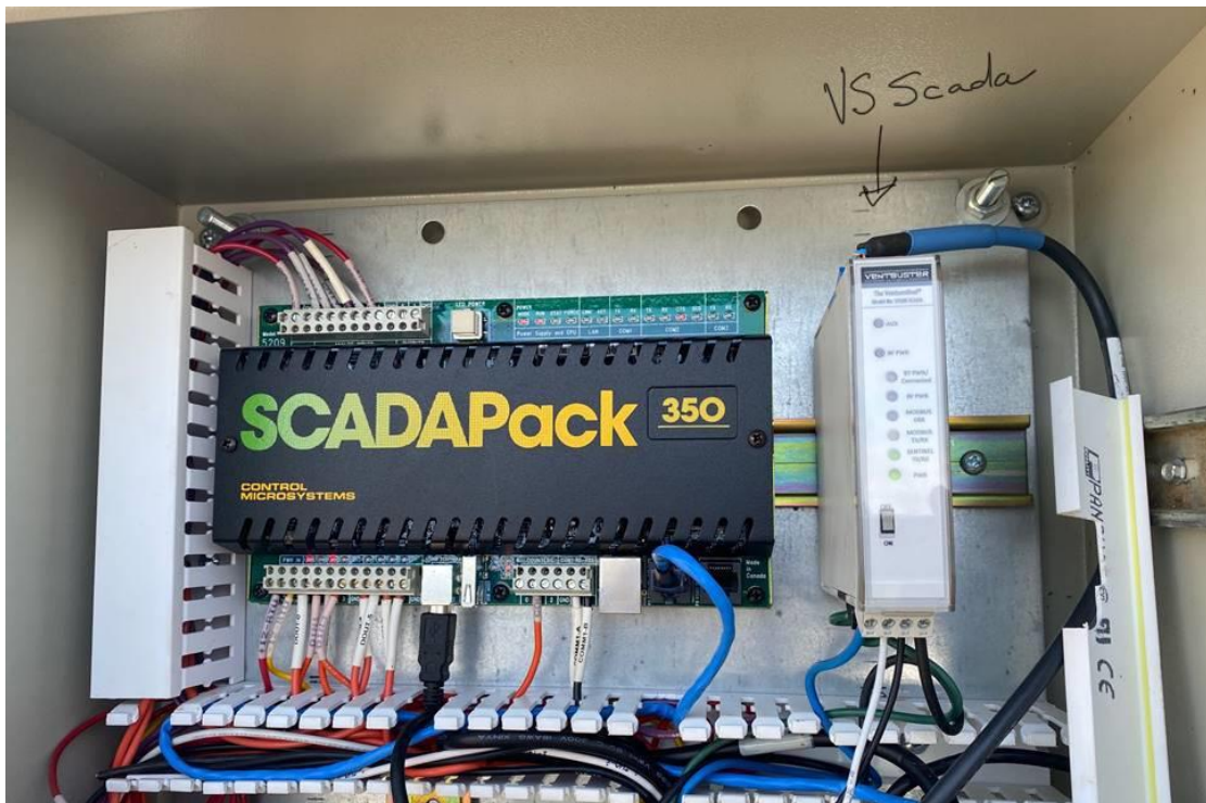
Figure 3. SCADA Pack, attached to wellsite power source, field trials.