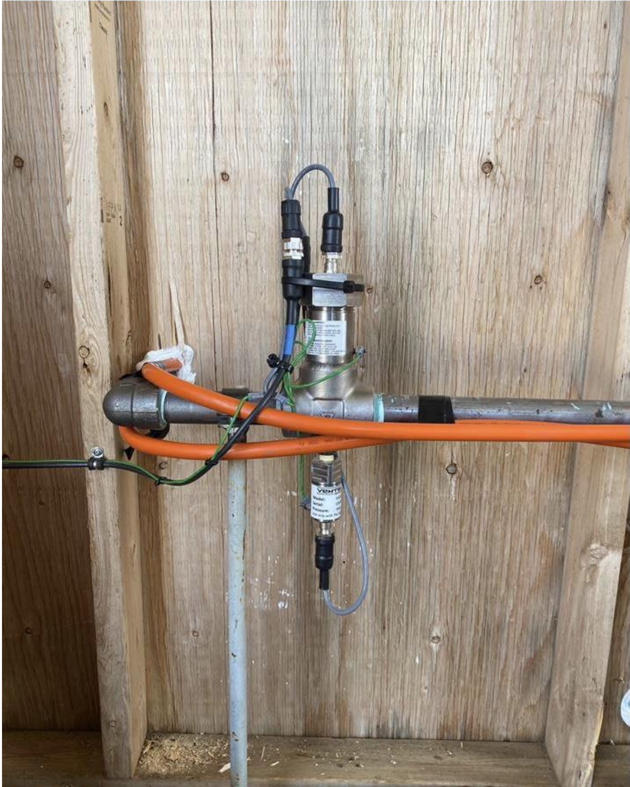
Figure 4. Ventsentinel® unit, field trails, close-up on the unit attachment to line.