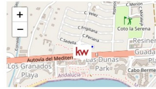
Cancelada, Estepona, Málaga