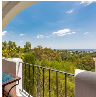
Apartment in Benahavís Puerto del Almendro, 2 bed., 2 bath, 116 sqm Sea views for 259.000 €