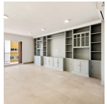
Apartment in San Pedro 3 bed., 2 bath, 125 sqm Fully renovated for 375.000 €

ALFONSO LACRUZ Real Estate in Marbella & Benahavís