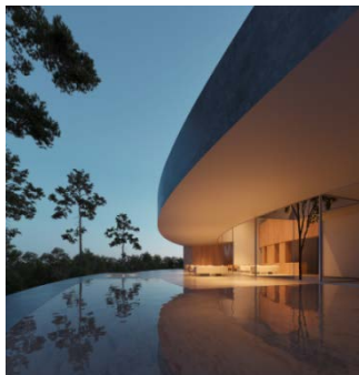
Villa in Benahavís New Construction, 6 bed., 8 bath, 1.004 sqm 2.400 sqm plot 4.990.000 €

In short, if you are looking to buy or sell a property, hiring a professional real estate agent can be an excellent decision, can make the entire process much easier and hassle-free.