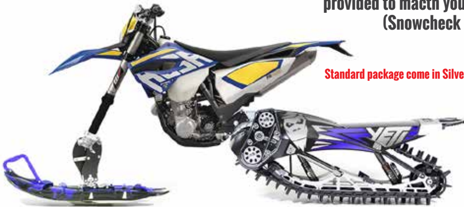
Standard package come in Silver/black

Make a statement with a large selection of graphic packages provided to match your bike (Snowcheck only)