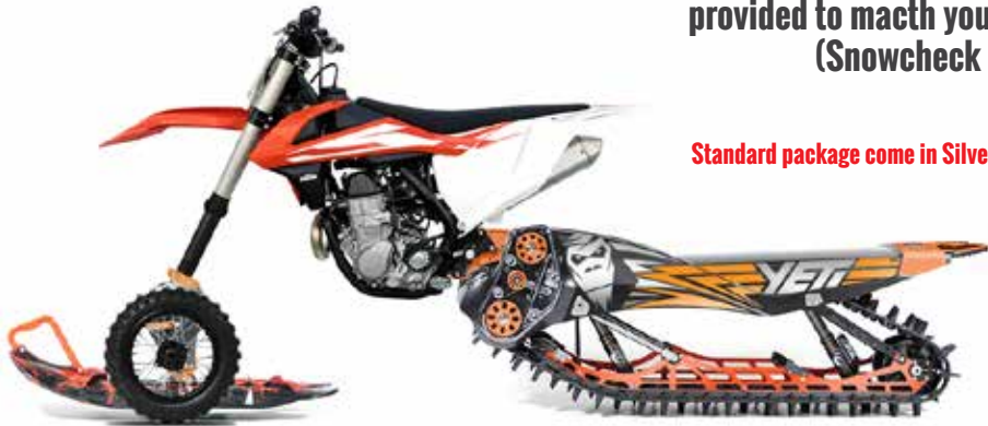
Standard package come in Silver/black

Customize your YETI SNOWMX with a large selection of anodizing packages provided to match your bike (Snowcheck only)