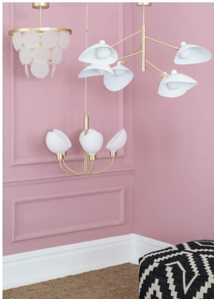
Clockwise from top left: Avanti Flush Chandelier £200 — Moa Chandelier £160 — Doral Chandelier £200

The Chandelier has been reimagined this season with three striking designs: sputnik metal forms, chandelier uplighters, and statement flush fittings in sensual brass, all bearing glass shades in soft opal, opaque and white frosted glass.