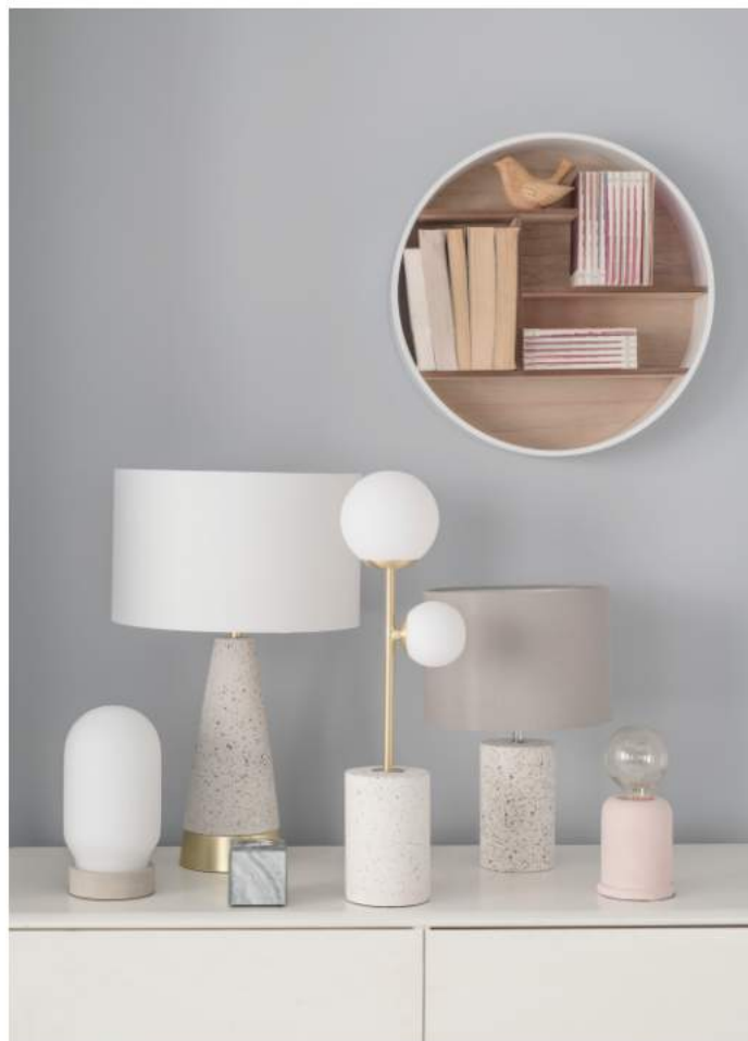
Clockwise from top left: Boba Table Lamp £35 — Freda Table Lamp £65 — Forella Table Lamp £65 — Dulce Table Lamp £40 — Minny Table Lamp £30

The cool energy of the Quartz range is captured in contemporary simplicity and cylindrical forms. A mineral palette of smoke, rose and milk combines with simple cylindrical forms to create occasional lighting with a soft, modern feel.