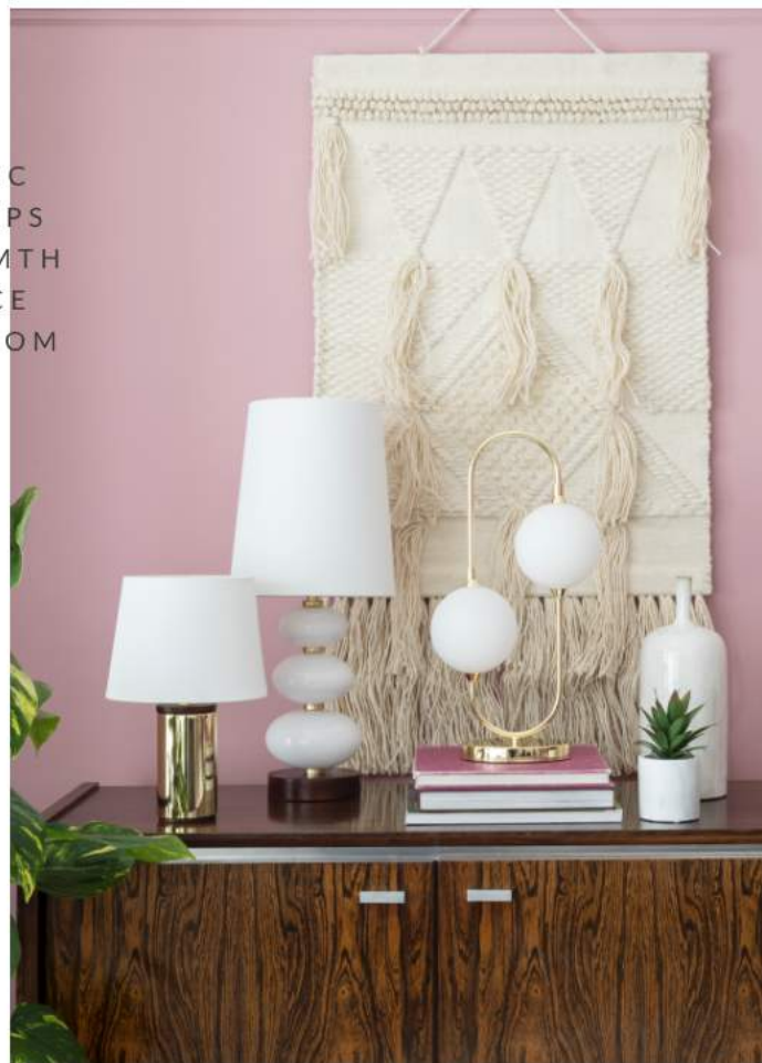
Clockwise from top left: Parnel Table Lamp £45 – Patty Table Lamp £70 – Beryl £50

RETRO-CHIC TABLE LAMPS GIVE WARMTH & ELEGANCE TO ANY ROOM