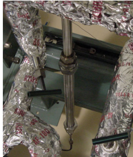
MPM High Temperature Reference Electrode Installed in Piping System