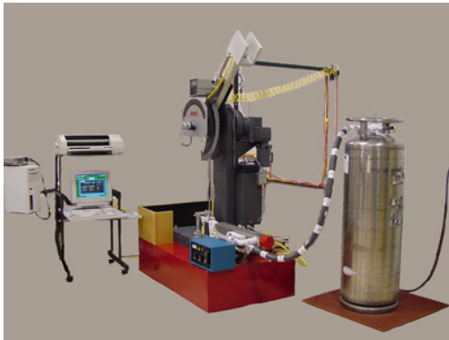
MPM In-situ Heating & Cooling - Large Capacity Machine Installation (U-Hammer)

MPM's patented In-situ Heating & Cooling System may be added to impact test machines (both pendulum and drop tower) for controlling the temperature of test specimens. The advantage of this technology is that test specimens are thermally conditioned right up to the moment of impact. Another advantage is that the test specimen can be more accurately centered prior to testing. The system replaces the practice of using external thermal baths.