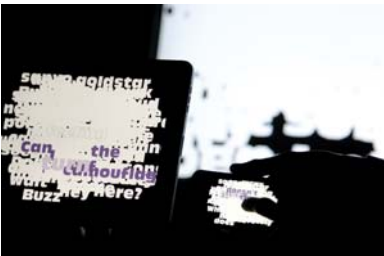
Buzz Aldrin Doesn't Know Any Better, touchscreen with Buzz iPad and iPhone app. Touchscreen interactives. (2008 - 2011)