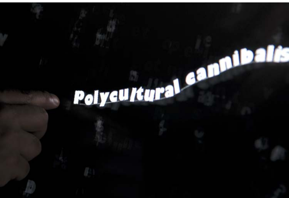
What They Speak When They Speak to Me, detail. (2008 - 2011)

Presented by the imagineNATIVE Film + Media Arts Festival