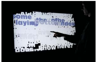
Buzz Aldrin Doesn't Know Any Better, touchscreen middle panel of Things You've Said Before But We Never Heard triptych (detail). Touchscreen interactive. (2008 - 2011)