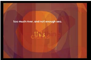
Smooth Second Bastard. Touchscreen interactive. (2011)