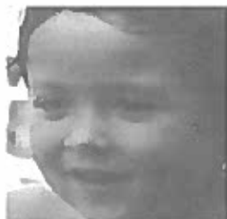
Aboriginal Film & Video Art Alliance of Ontario: Elder Voices

It Starts With a Whisper follows a young woman who has grown up on a Reserve and her decision about which path to follow in life. Guided by her ancestral spirits - three matriarchal clowns who appear in the form of her three aunts - she comes to the realization that she may live her life in the present, while remembering and respecting the people of the past and traditional ways. It Starts With a Whisper blends traditional