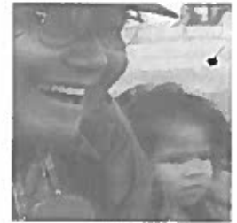
Aboriginal Film & Video Art Alliance of Ontario: Elder Voices

incredible age and mystery. What do we know of them? A scientist may say a lot about them: what does a young woman or traditional say? In this short program, two members of the aborigi- nal community speak about the mounds. Images of the mounds pass one to the other. Ultimately, it is the mounds themselves that say the most. That and the song of a young woman. OUR HOME OUR FUTURE Sioux Lookout (10:30 min.). Sioux Lookout in the heart of Ontario is the home of survivors. Two generations speak, and the past and present reflect each other. Survival for the Elders who speak in this video meant carrying bags of flour weighing hundreds of pounds. Survival for those of the latter twentieth century means enduring burdens of a different sort. This video is about the heart and back-breaking work that goes into making this community live. In English and Oji-Cree with English voice over. MTIG Rama First Nations (8:35 min.). "Mitig" is a quiet and suggestive meditation on a community. This is an essay of emotions and images, rather than thesis and argument. We are taken through a day visiting Rama First Nations. Children play, swim, speak unselfcon-