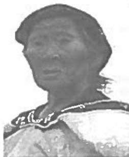
Zacharias Kunuk: Nunavut