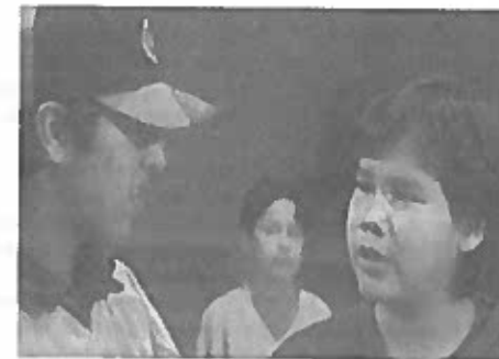
Doug Cuthand: The New Kid

The New Kid is a short story written and performed by the grade seven and eight students at Pleasant Hill