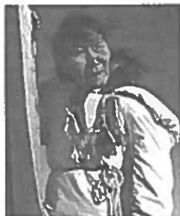
Zacharius Kunuk: Nunavut

Indian Mainstream depicts elders of the Karuk, Hupa, Tolowa and Yurok tribes of Northern California, as they work together to preserve a once-dying culture. It illustrates canoe-making, basketry, ceremonial dress, native tongue, social dancing, foods and village reconstruction.