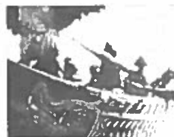
Stephen Foster: Romantic Savage

This half hour program provides an overview of early Native American life, before Columbus. In the beginning we see an early Northwest Coast legend (of how the sky came to be) acted out by Native American actors. Our host introduces us to the oral traditions of Indian people and goes on to tell through slides the differences and similarities in Native art, music and religion, before the time of Columbus. Part of the first nationally televised series to be entirely produced by Native Americans, including Powerless Politics and Treaties .