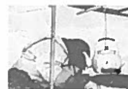
Arnait Ikkajurtigiit: Qulliq