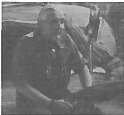
Aboriginal Film & Video Art Alliance of Ontario: Elder Voices