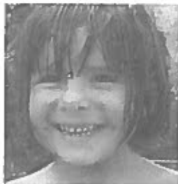
Aboriginal Film & Video Art Alliance of Ontario: Elder Voices

This is a four-part documentary about the Yakwa, the most important ritual of the Enauene-Naue Indians. For seven months every year, the spirits are venerated with offerings of food, song and dance so they will protect the community. The World Outside the Rock - The Yaokwa festivities open with the Enauene-Naue preparing for the big fish-catch by making salt, canoes and fish traps. Fearing the spirits, the Indians make new flutes, and explain their sacred significance. Dataware's Revenge - For two months, the men leave the village in groups and build dams on forest waterways to catch fish as they return from spawning. Xinare , the village elder, tells the myth