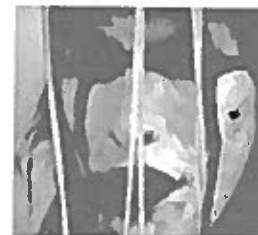
Boye Ladd: A Warriors Dream