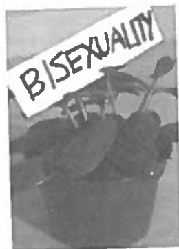
Thirza Cuthand: Bisexual Wannabe