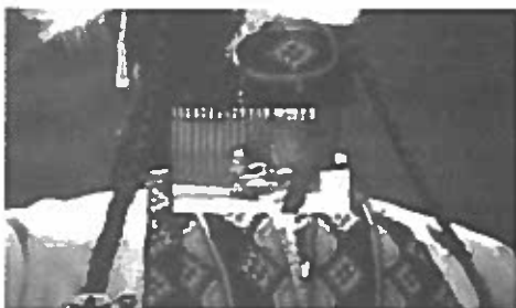
Tuire Portiguara: Mekaron

RLTC - Round Lake Treatment Centre R.R. 3, Comp. 10, Grandview Flats North Armstrong, British Columbia Canada VOE 1B0 Phone: (604) 546-3077 Fax: (604) 546-3227