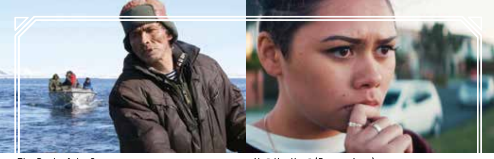
The Book of the Sea