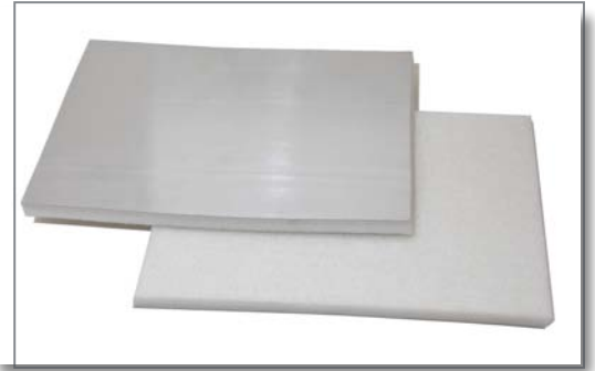
VyBar ® Marine 48F 10mm

VyBar ® Marine effectively treats the often combined phenomena of vibrations, sound transmission and sound reverberation encountered with most noise problems.