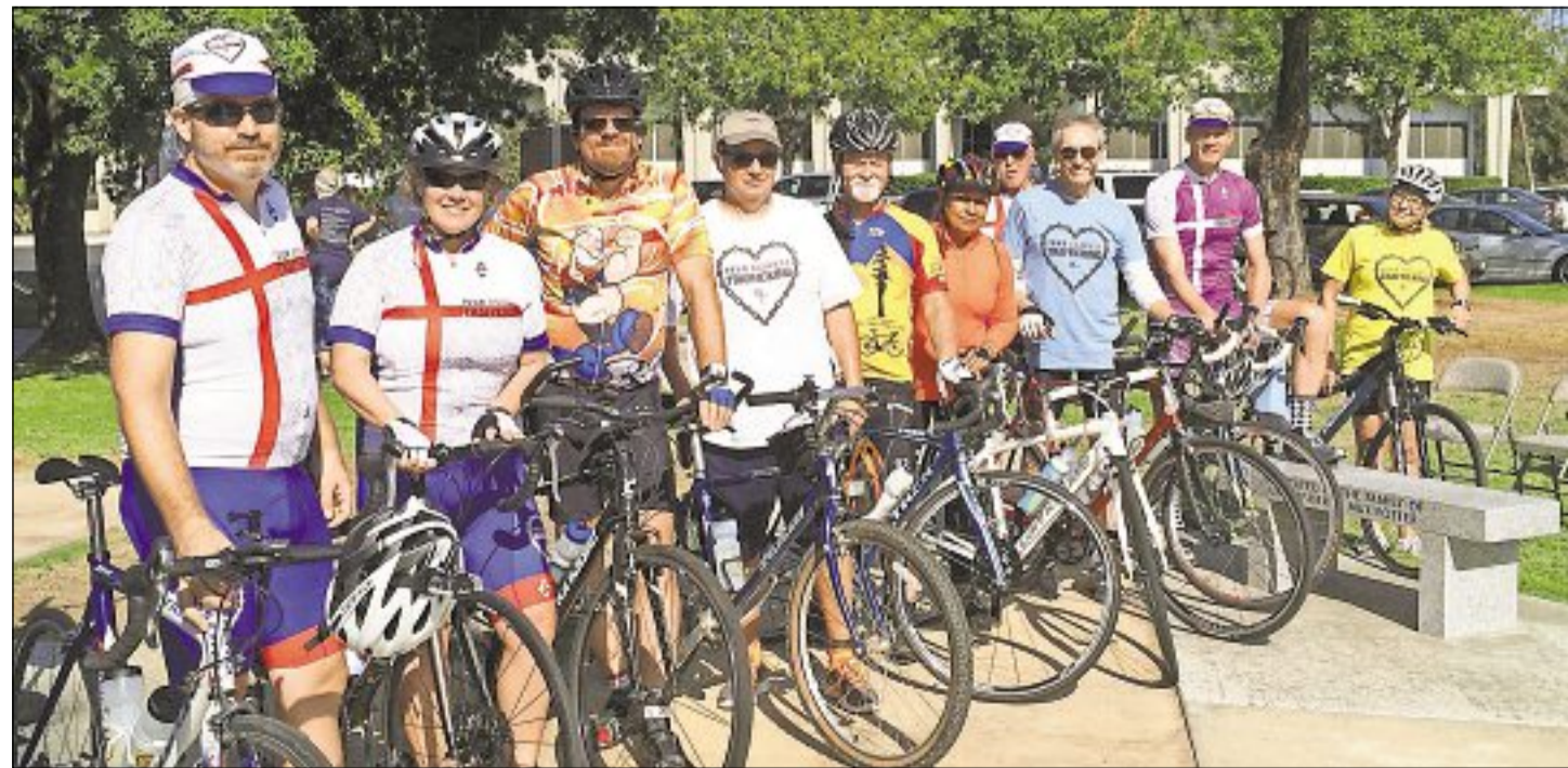
Riders from the "Tour Against Trafficking" organized by the Episcopal Diocese of San Joaquin. This ecumenical effort and event sought to raise awareness about Human Trafficking in the region and to raise funds for organizations like Family Services of Tulare County. Funds received from the 2015 tour went to establish Family Services' emergency assistance funds for victims.

For more information, go to www.visaliachamber.org