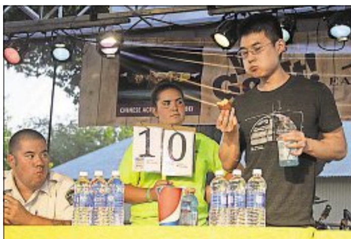
Annual corn dog-eating contest

Talented local kids are also invited to participate in the third annual Kids Talent Auditions at 12:30 p.m. on Saturday, Sept. 17, to compete for cash and prizes. Each contestant, age 14 and younger, must come prepared with a two-minute audition piece and music must be on a CD. Twelve finalists will be