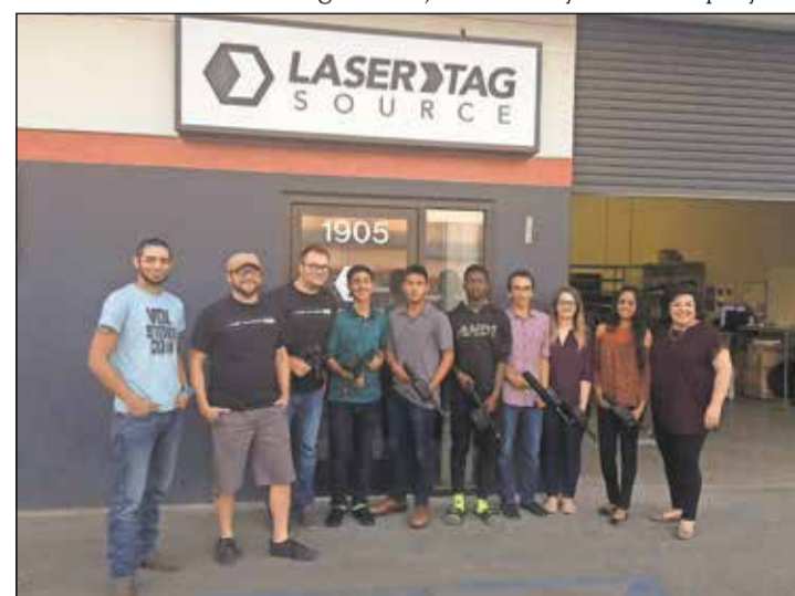
YEA! students visit Laser Tag Source and are inspired to think differently about small business.