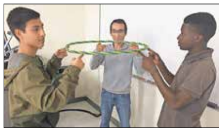
YEA! students learn to work together as a team during the first class activity.

The second class included the first field trip of the year. The students visited Laser Tag Source, a relatively new company to