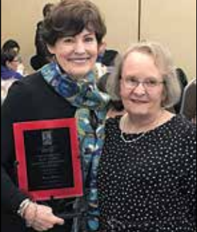
Read for Life