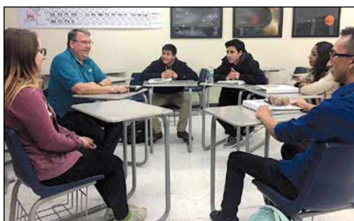
YEA! students brainstorm attention grabbing opening statements

The students next had the opportunity to meet with professional graphic designers who are partnering with them to create a business logo as well as help to brand the company. The graphic designers have volunteered their time to work for the students and produce professional quality work. By the end of February each student business will have a new logo, a business card and a marketing piece i.e. brochure, post card or label that they will be able to use to promote their business to future customers. As the students met with the designers they took time to really think through their brand and what