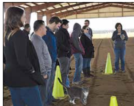
Leadership Visalia Students Tour Happy Trails Riding Academy

Additional information may be obtained online at www.calwater.com .