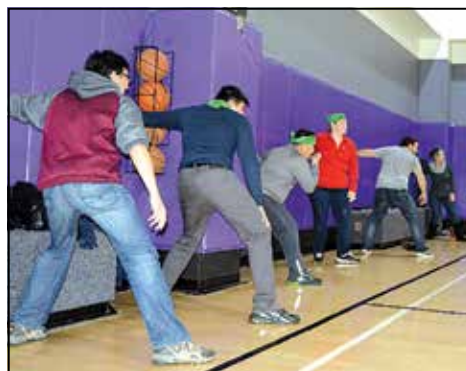
Leadership Visalia Students participate in a heated game of Dodgeball at the Lifestyle Center