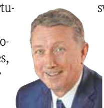
Warren Gubler Mayor, City of Visalia

To contact Mayor Gubler directly, email warren.gubler@visalia.city .