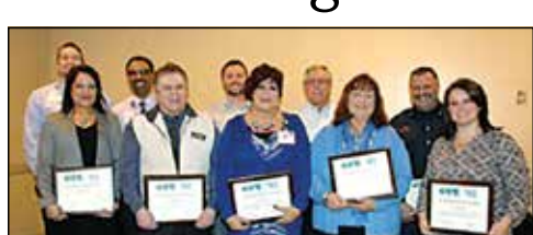
VPIE Outstanding Partners

On January 19th, 2017 Visalia Partners in Education, along with Visalia