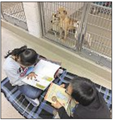
Pro Youth Goshen

ful collaborative effort with Pro-Youth and the new animal shelter. The Pro-Youth Goshen After School third-graders visit the Visalia Animal Care Center to read to the animals. Paws and thumbs up all around. Visalia made the Top 25 Happiest Places to Live!!! We could not agree more. We love our community. Gallup and Healthways created a Well-