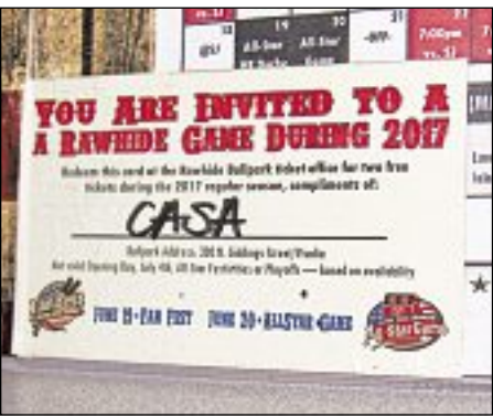
Visalia Rawhide / CASA

Ronald McDonald House Charities of the Central Valley came to Visalia to make a presentation to share their mission with over 500 of employees at VF Outdoor and would like to thank them for their generous donation of over $75,000!