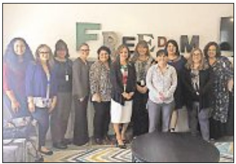
Tulare County Freedom House

Our partners from Tulare County Health & Human Services Agency Child Welfare Services came to tour the new Family Services of Tulare County Freedom House , where our human trafficking services will be based. We are excited to be partnering with CWS to provide a drop-in center for youth at risk for commercial sexual exploitation of children.