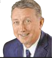
Warren Gubler Mayor, City of Visalia

A key theme of the General Plan is to encourage new development to occur within existing city limits and emphasize renovating or rebuilding existing buildings, as opposed to consistently growing outwards. To accomplish this, the City relies on two primary sets of regulations, the Subdivision Ordinance and the Zoning Ordinance. At the March 6th City Council meeting, the Council adopted Ordinance No. 2017-01, adopting the City's Title 16 (Subdivision Ordinance), Title 17 (Zoning Ordinance), the Zone Map and amendments to the General Plan Land Use.