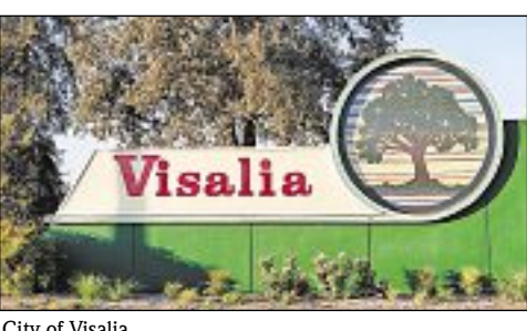
City of Visalia

Being Index which measures whether an individual feels a sense of purpose, has supportive relationships, is financially secure, satisfied with their community and are in good physical health.