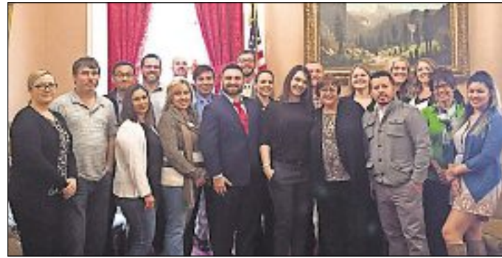
Leadership Visalia in Senator Fuller's Office

The class moved to the center of the building to start its guided tour of the working museum. The tour started under the Capitol Dome. The tour revealed historical rooms, incredible architecture, the Senate and Assembly Galleries, portraits of each past Governor, and ended at the Tulare County Box. Each California County has a large box that reflects what the county offers to the state. Care to guess what Tulare County offers to the State and the Nation? The class finished its day on the steps of the Capitol building for class and individual pictures before boarding the vans to return to Visalia.