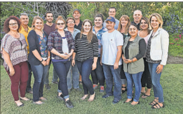
Leadership Visalia students spent 2 days at a retreat at Wonder Valley Ranch & Resort