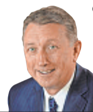
Warren Gubler Mayor, City of Visalia

To contact Mayor Gubler directly, email warren.gubler@visalia.city .