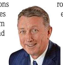
Warren Gubler Mayor, City of Visalia

The Games brings participants from throughout the western United States, with the majority of our participants, 390 to be exact, coming from the region outside of Visalia, between Madera and Bakersfield. The economic boost that the Games provides is shown in the hotel