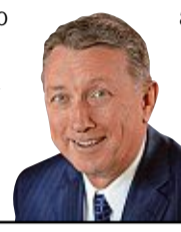
Warren Gubler Mayor, City of Visalia

To contact Mayor Gubler directly, email warren.gubler@visalia.city .