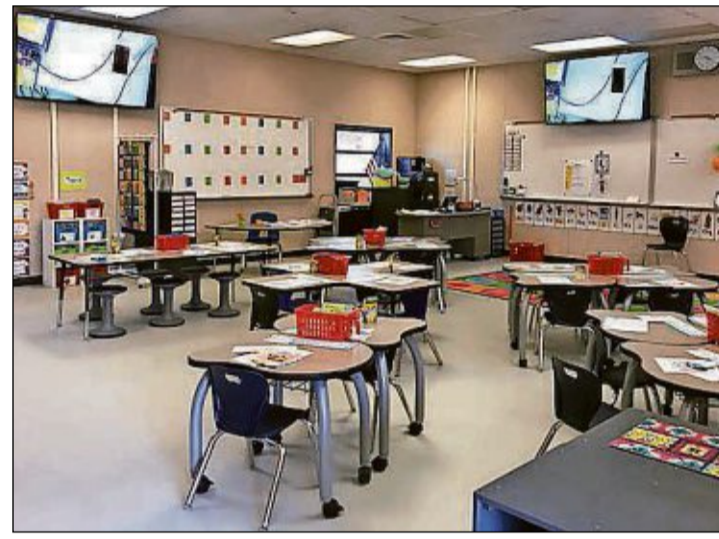
... and after modernization!