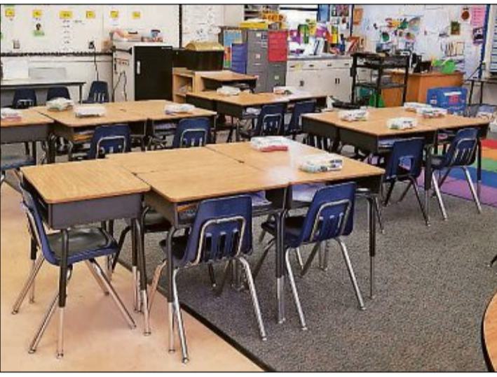
Goshen Elementary classroom before modernization ...