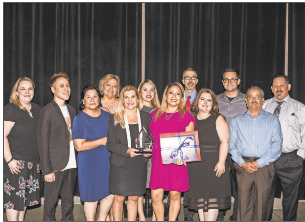
Large Business of the Year – Wyndham, Visalia