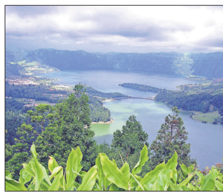
The Azores St. Michael

Enjoy a free morning to choose how you experience Terceira. Maybe you'll decide on an optional tour to a dairy farm, where you'll get to milk a cow and taste the dairy products. Or perhaps strapping on your hiking boots and embarking on an adventurous trek along two volcanoes at Misterios Negros Nature Reserve is more to your liking. Next, we gather and head underground to experience the ethereal Algar do Carvao, the "Cavern of Coal," with an expert guide. Then, it's your choice! Choose to swim in the natural volcanic pools of Biscoitos -OR- hike along