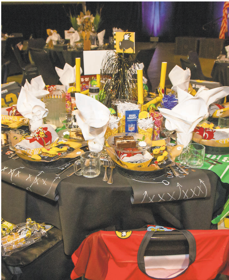
Buffalo Wild Wings Best Business Theme

Winners were chosen by a committee of past winners. The committee reviewed applications and interviewed each finalist then scoring on a point system. Winners were announced at the Visalia Chamber of Commerce's 66th Annual Awards Celebration held on June 13, 2019, at the Visalia Convention Center.