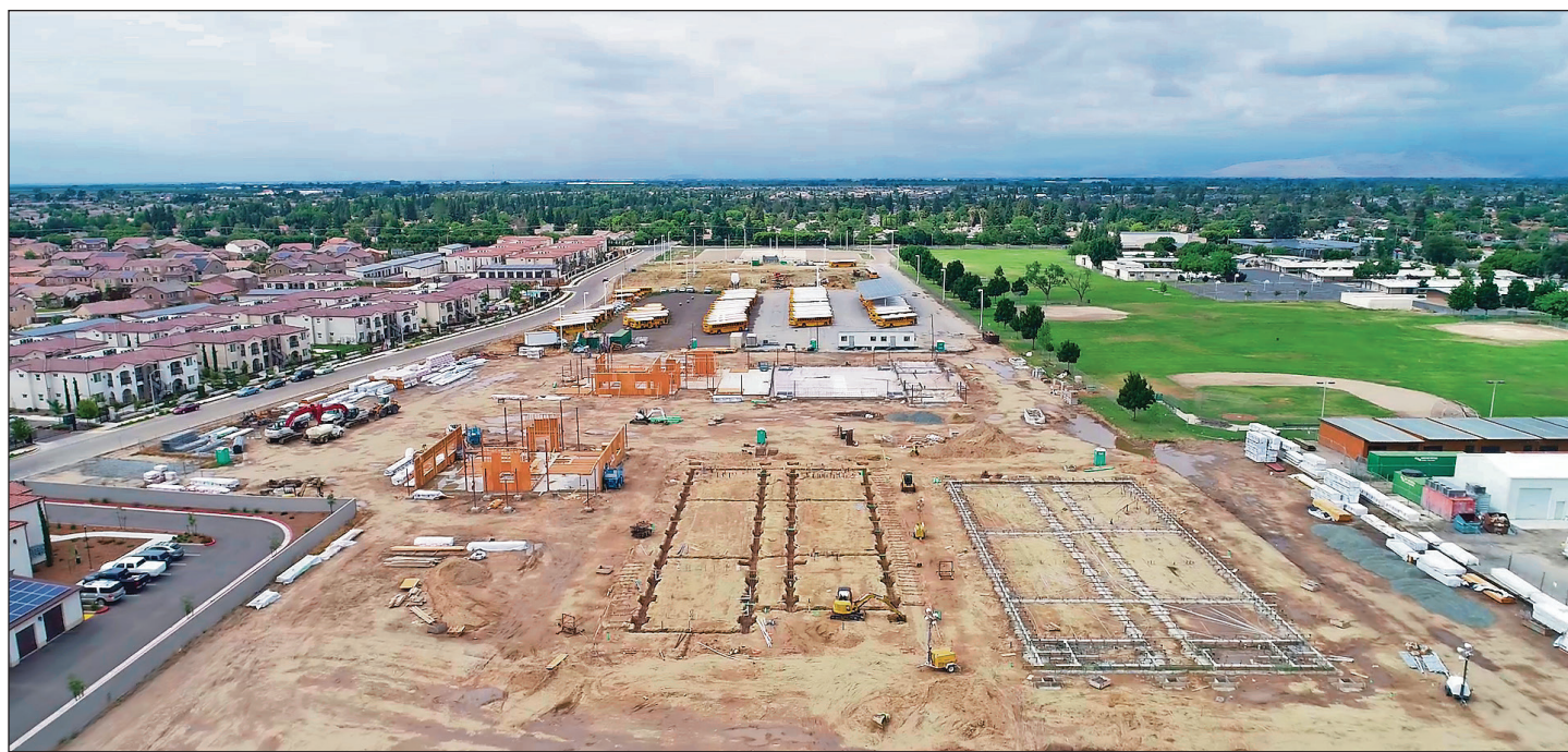
Construction continues on VUSD's Sequoia High School.

VUSD is grateful to the community for supporting our kids and campuses and we thank our hard-working staff for helping us provide the best educational spaces for students. Our goal is always limitless opportunities for their futures.