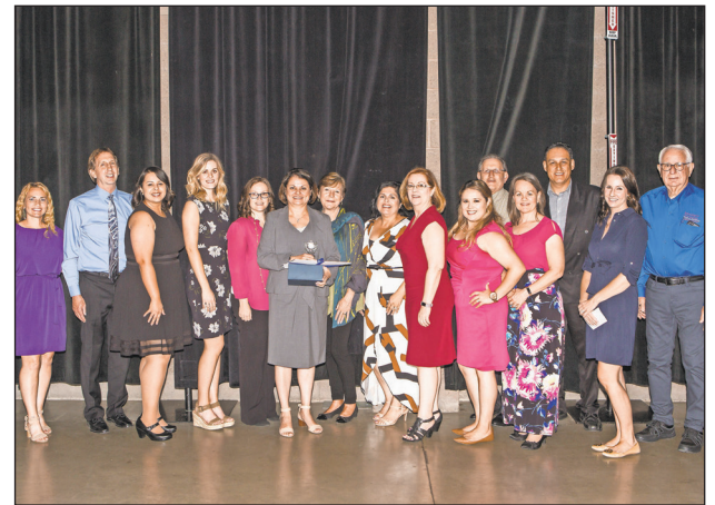
Non-Profit of the Year – Community Services Employment Training (CSET)