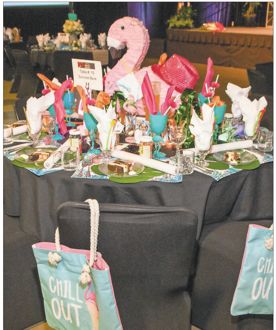
DMI Best Overall Theme