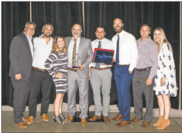
Medium Business of the Year – 4Creeks, Inc.