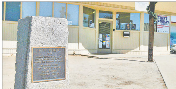
A plaque at the corner of Oak Avenue and Garden Street commemorates the location of the first structure ever built in Visalia, and in most of the Valley. Fort Visalia stood from 1852-1855.