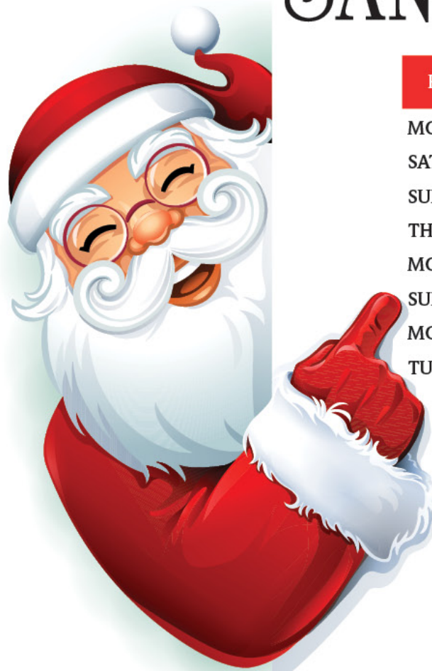
PHOTO OPERATING HOURS

MON-FRI: 12:00 PM - 8:00 PM, BREAK: 3:15 PM - 4:00 PM