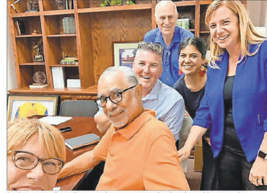
Action group founding members meet to plan lunch and learn series.

I believe strongly in the power of thoughtful leaders, particularly those that put innovation at the forefront. Through my position at the Chamber, I have watched first hand as business leaders tackle major issues and develop innovative solutions. At that City Council meeting in August, it became