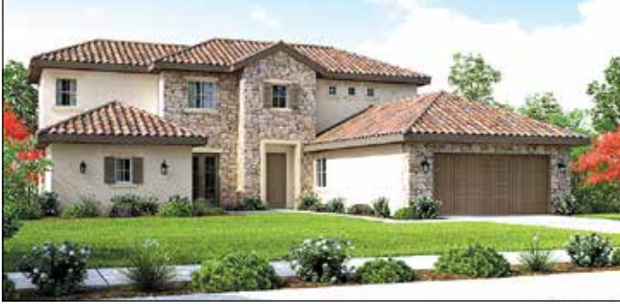
San Joaquin Valley Homes' San Marino community celebrated its grand opening recently in northwest Visalia.