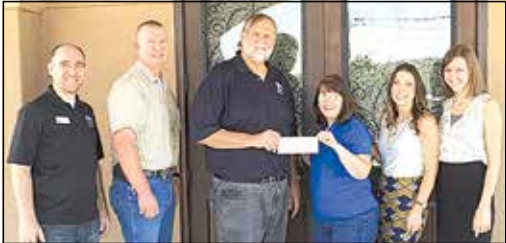
Visalia Rescue Mission

Visalia Rescue Mission said: A big THANK YOU to Lennar Charitable Housing Foundation for their generous donation of $20,000--we'll use it wisely to actively fund LIFE CHANGE.