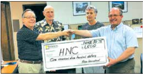
Hands in the Community

Hands in the Community - Our partner, Southern California Edison (SCE) , has been a committed partner with HNC almost from the beginning. From purchasing gifts for families during our first Christmas season to donating computers for our office, they've continued to help the community thrive. Now, they've delivered a monetary donation for our cause. Thank you from the bottom of our hearts!