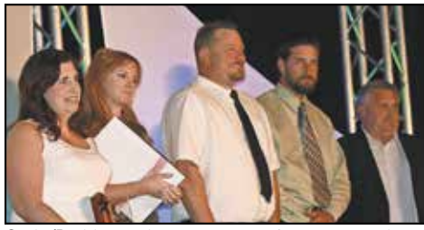
Seals/Biehle employees onstage after winning the Medium Business of the Year Award.

The mission of Seals/Biehle Inc. is to be an industry leader in construction services, bringing value to clients, suppliers, and vendors through their ability to fulfill their needs and exceed their expectations.