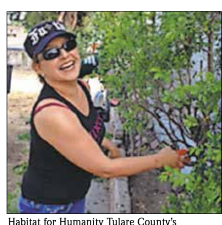
Habitat for Humanity Tulare County's "Women Build" project