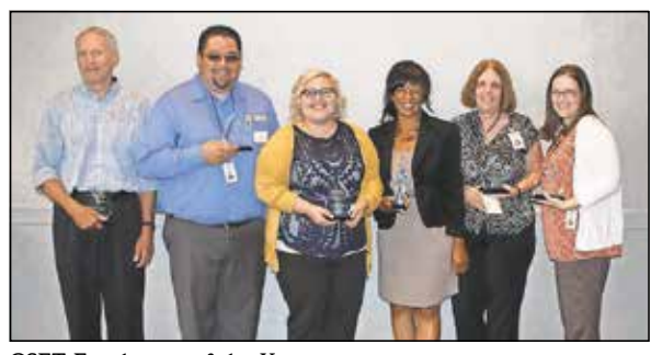
CSET Employees of the Year

Congratulations to CSET's Employees of the Year! They do tremendous work and make a huge difference in our community.