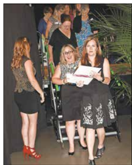
Family Services of Tulare County accepted the award for Non-Profit of the Year.

"The work we do really is a team effort, and our mission would not be possible without our donors and supporters. We often see our clients at their lowest point, but we also get to see many of them reach their goals."