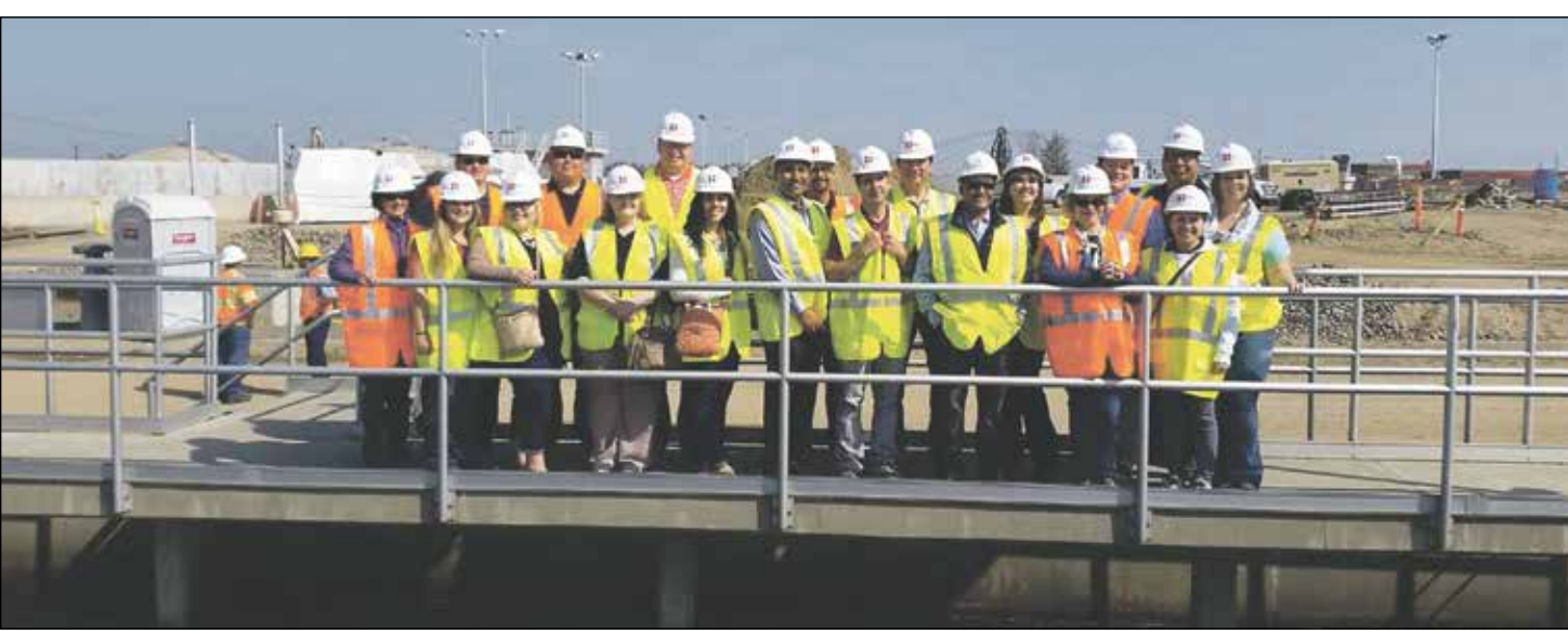
Leadership Visalia class members at the water treatment plant.