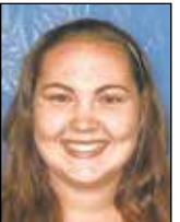
Gladden Sugar House

It is an opportunity every young entrepreneur needs to snatch up.