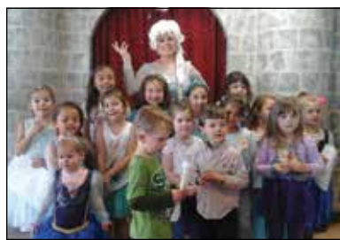
ImagineU Children's Museum

ImagineU Children's Museum had a fantastic Spring Break camp. They ended the week with a Princess Tea Party filled with crafts cookies and a visit from Princess Elsa from Frozen.