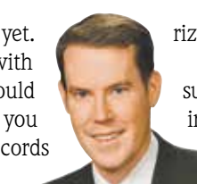
Brett T. Abbott Gubler & Abbott LLP

Employment records should be kept in individual personnel files, restricting access to the files as they usually contain private and/or sensitive information. The ideal place for such records is a locked cabinet with access by one person or department from whom autho-