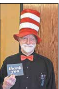
CASA of Tulare County