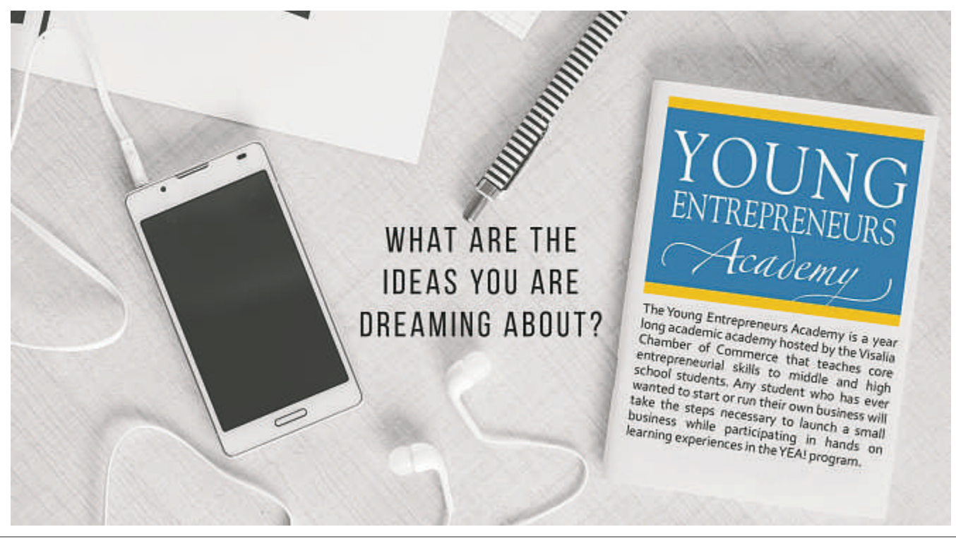
VISALIA TIMES-DELTA • APRIL 30, 2016