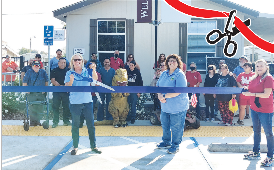
Agusta Communities held a ribbon cutting in celebration of their newly remodeled mobilehome community, Rancho Robles located at 26814 S. Mooney Blvd.