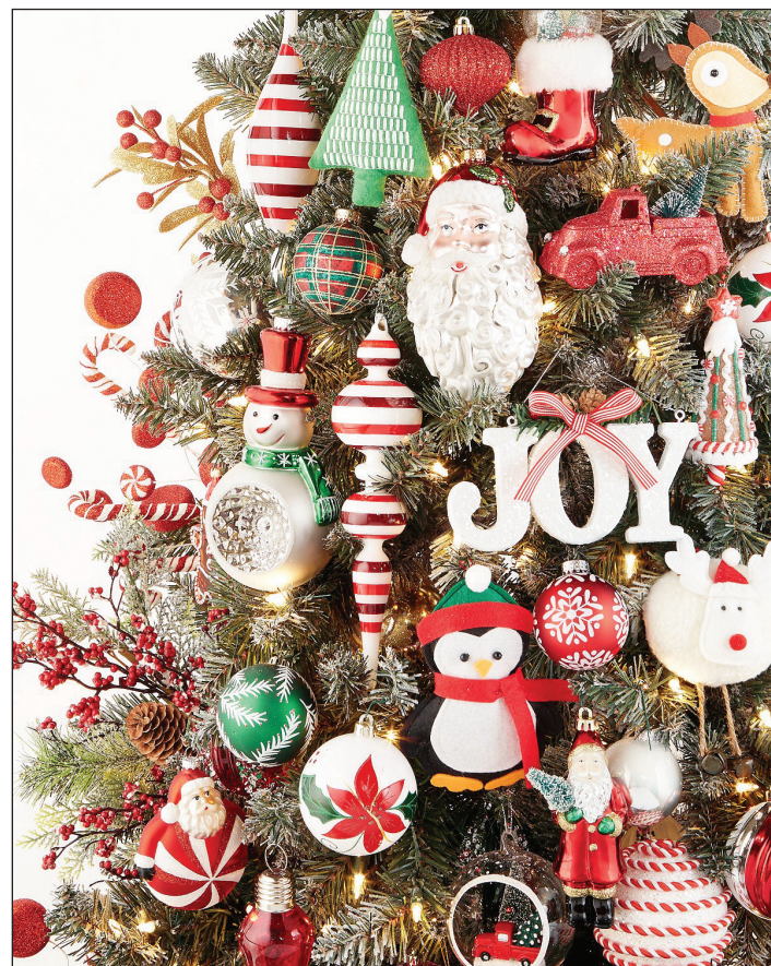
Classic Christmas imagery, a traditional palette of red and green and a touch of whimsy give new life to timeless seasonal icons in this Christmas Cheer Décor Collection from Holiday Lane.

Outside the Believe Campaign; the store is involved in many other local charities this holiday season including the Valley Oak SPCA and the Central Valley Vietnam Veterans or-