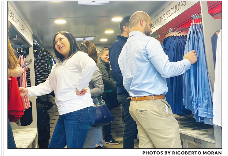
Giant Threads at COS seeks to help students with professional attire.

For company leaders and executives, the conference will provide the opportunity to refresh skills and talk about the latest and greatest in leadership trends. For the creators and agents of change within a business, this conference will connect you to other entrepreneurs and changemakers, while providing insights to innovation and creative energy. For the new start-up businesses, this conference will help you spread your brand and provide a valuable networking opportunity to learn about trends and hear from potential customers. For those looking