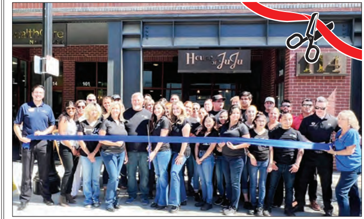
In celebration of their Visalia grand opening, House of JuJu hosted a ribbon cutting. Visit them at 114 W. Main St.