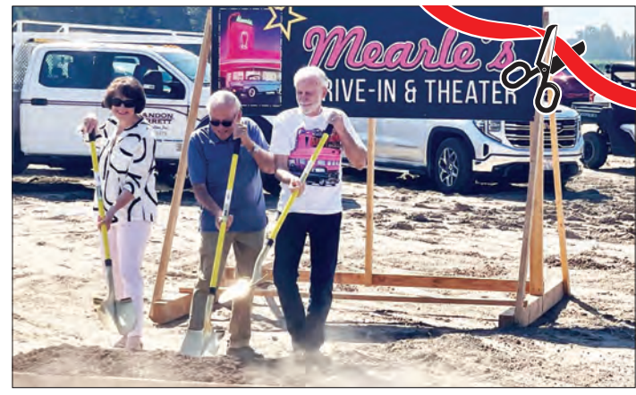
Mearle's Mooney Drive-In hosted a groundbreaking ceremony in July. The restaurant and drive-in will be located at the Northeast corner of Mooney Blvd. and 264 with an expected opening date in 2025.

It was noted by the medical facility that when the blood supply is precarious, critically ill and emergency room patients are prioritized. Kaweah Health stated that its goal is to be able to fulfill all of its patient's needs for blood, but when blood donations are low, it impacts