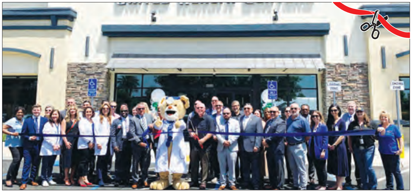
United Health Centers hosted a ribbon cutting in celebration of their grand opening of their 4038 S. Mooney Blvd. location in Visalia.