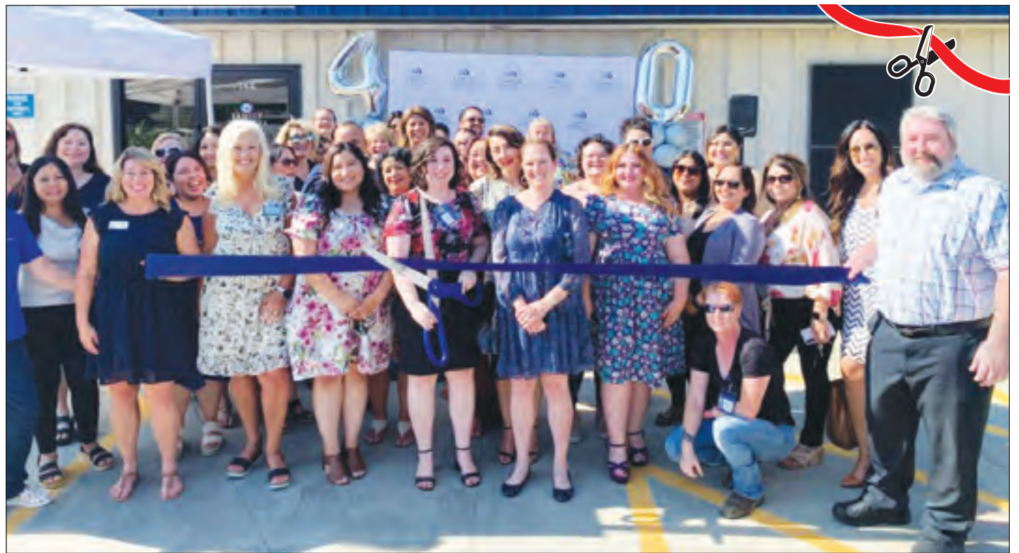
In celebration of Family Services of Tulare County's 40th Anniversary, the organization hosted a ribbon cutting at their new location at 744 E. Douglas Ave.