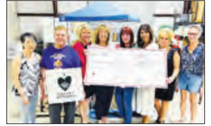
VALLEY STRONG CREDIT UNION