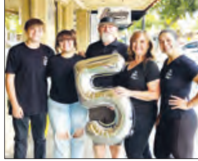
THE SALAD SHOP

Valley Strong Credit Union sponsored Visalia Emergency Aid's (VEA) Turkey Trot event, allowing VEA to purchase over 39,000 pounds of nutritious foods and snacks to feed families with children, seniors, veterans, and an additional 1000 children during the Holiday Season.