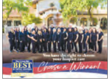
AMERICAN CARE HOSPICE

American Care Hospice was recognized and awarded Gold in the 2023 The Fresno Bee Best of Central California, The People's Choice.