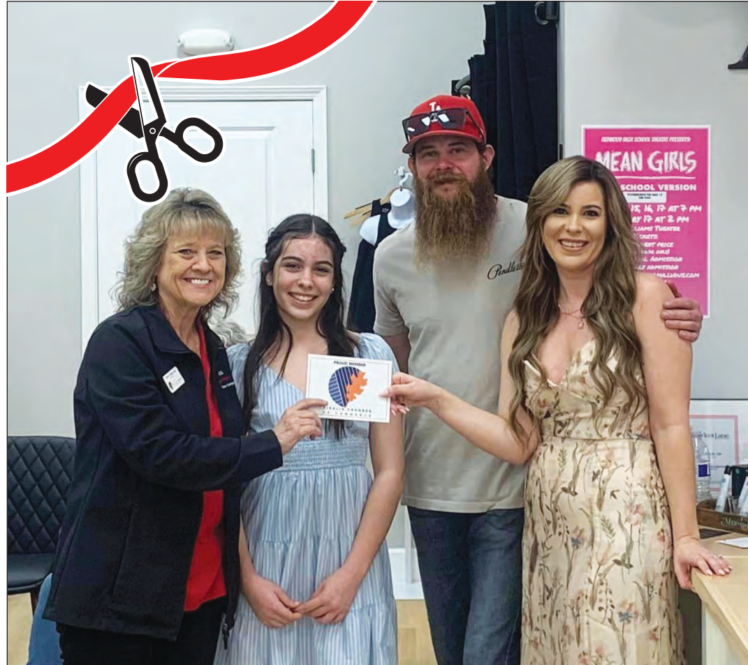
Apricot Lane Boutique hosted a ribbon cutting in celebration of their grand opening weekend located at 117 E. Main St.