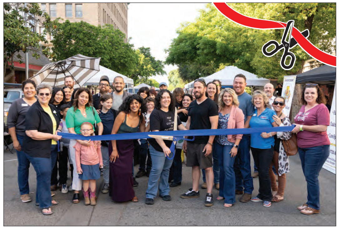
Downtown Visalia's Certified Farmers' Market hosted a ribbon cutting in April in celebration of their season opening. Gather at the market on Thursday Nights, April-June and September-December on Church and Main Street.