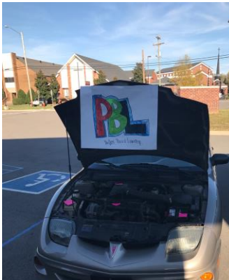
Can you label parts of this engine?

Team Mean Machine's Driving Question is "What can you teach others about an engine?"