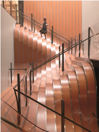
Longchamp SOHO Category: Commercial / Corporate Atmosphere Design Group