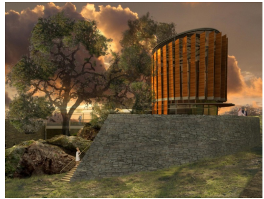
Williams Selyem Winery Category: Un-built D.arc Group / RBA, LLC