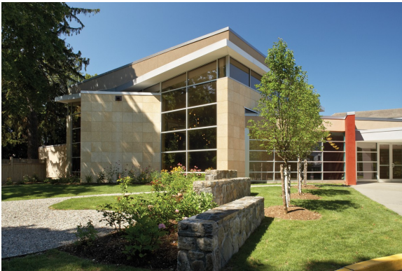
Bet Torah Synagogue Category: Institutional Perkins Eastman