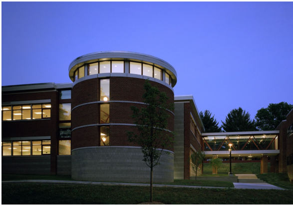
Horace Greely High School Category: Institutional Kaeyer, Garment & Davidson Architects & Engineers, PC