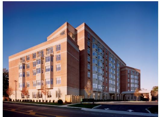
Willow Towers Assisted Living Category: Multi-Family Residential Perkins Eastman