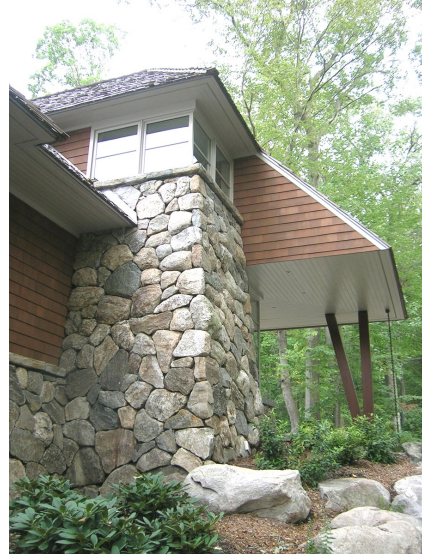
Pound Ridge Guest House Category: Single Family Residential Kaehler-Moore Architects