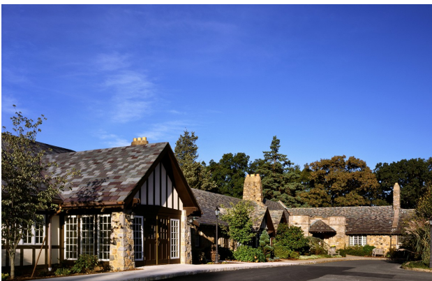
Lapham Community Center Category: Municipal / Community / Planning The Geddis Partnership PC