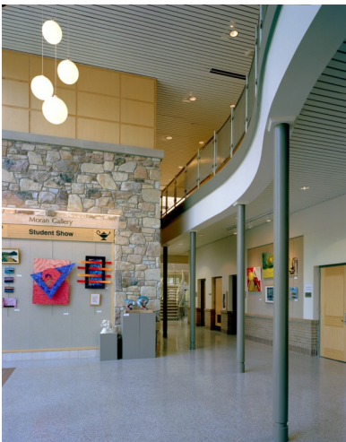
Science and Art Center Category: Institutional Peter Gisolfi Associates