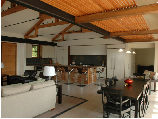
Milan Guest House Category: Single Family Residential Kaehler-Moore Architects