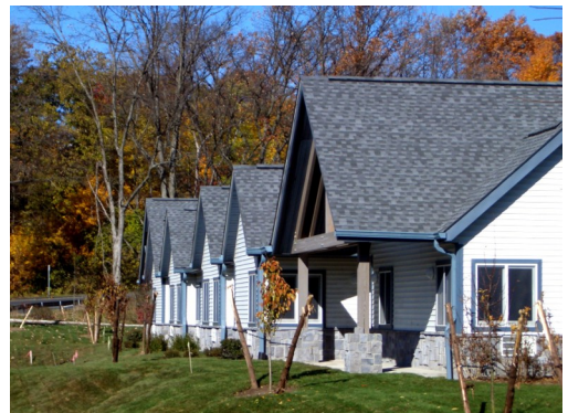
Tendler Independent Living Center Category: Multi-Family Residential Michael Shilale Architects LLP