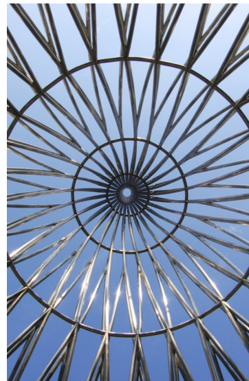
The Rising Category: Municipal / Community / Planning Frederic Schwartz Architects