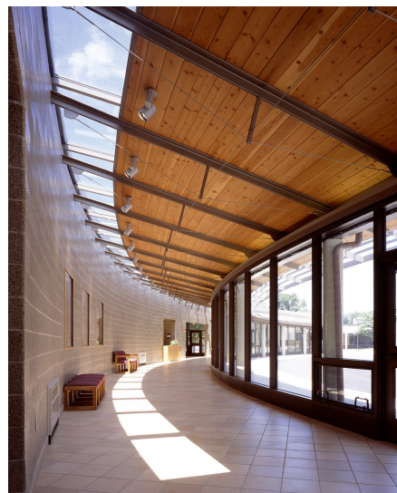
John Jay Middle School Category: Institutional Kaeyer, Garment & Davidson Architects & Engineers, PC