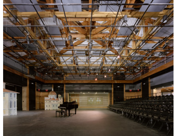
Harvey School Arts Center Category: Interior Architecture Kaeyer, Garment & Davidson Architects & Engineers, PC