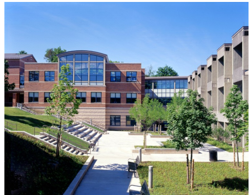
Irvington Community Center Category: Institutional