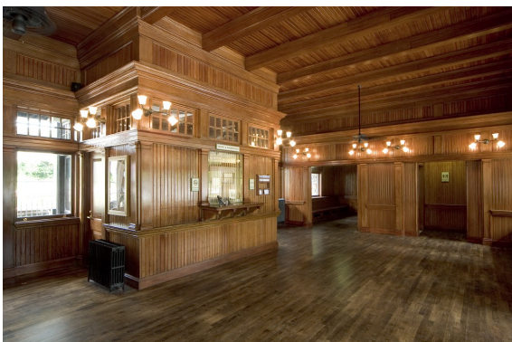
Chappaqua Railroad Station Category: Historic Restoration / Adaptive Reuse Wank Adams Slavin Associates, LLP