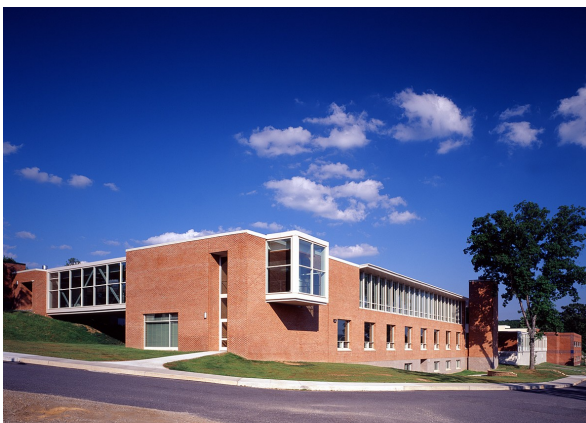
John Jay High School Category: Institutional Kaeyer, Garment & Davidson Architects & Engineers, PC