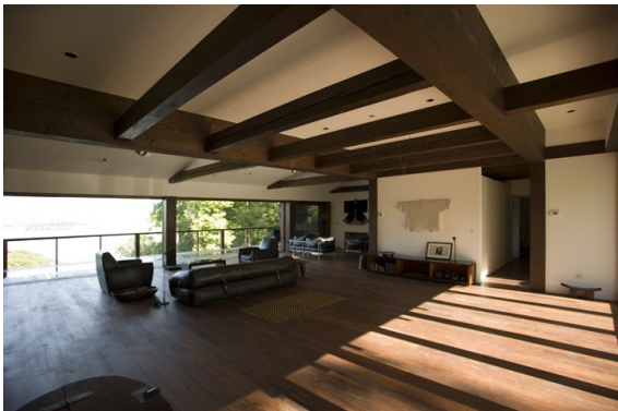
River House Category: Single Family Residential Barry Price Architecture